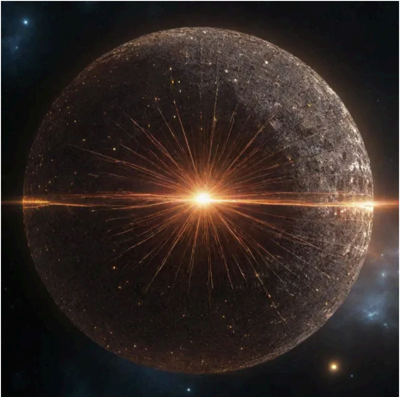
Picture 2. Dyson sphere

Dyson suggests constructing a massive sphere, about 1 astronomical unit (150 million km) in radius, encircling the Sun. With a shell thickness providing 200 g of material per square centimeter, the Dyson Sphere could be habitable. Its surface area would be about 1 billion times that of Earth, supporting 3 \times 10^{23} inhabitants. Dyson notes an intriguing correlation between planetary masses, artificial biosphere thickness, solar output, and technological development timescales. Within 2,500–3,000 years, intelligent beings are likely to create artificial biospheres surrounding their stars.