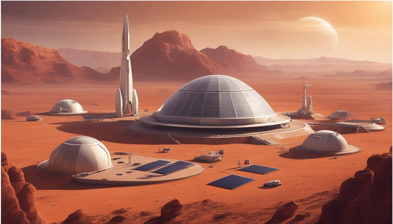
Picture 2. SpaceX Mars Base Architecture

But why should humanity limit its activities to the Solar System? Earth intercepts only one two-billionth of the Sun's energy output. Sooner or later, humanity must harness "all solar heat and light" and begin spreading throughout the Solar System.