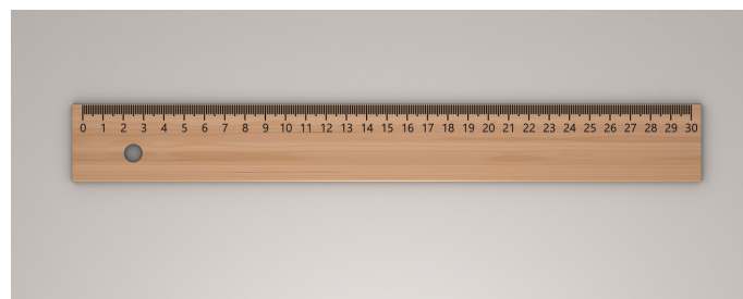
Figure 2: Scale with least count of 1mm

A 2000 pages book is selected. That means 1000 sheets of paper will be there. If