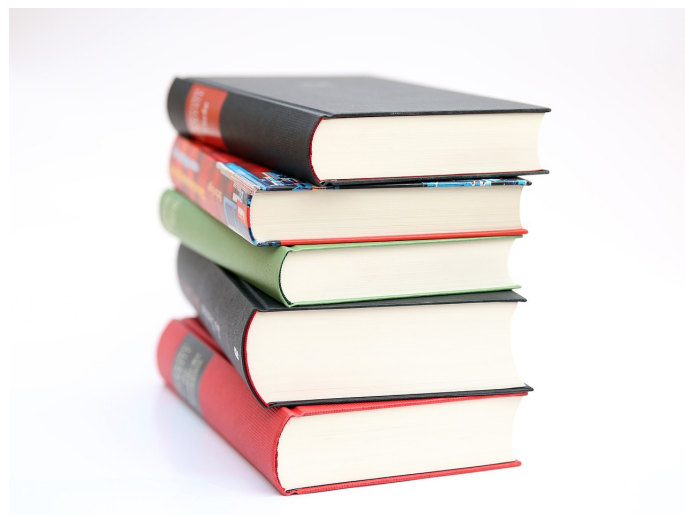
Figure 1: books

A 2000 pages book is selected. That means 1000 sheets of paper will be there. If