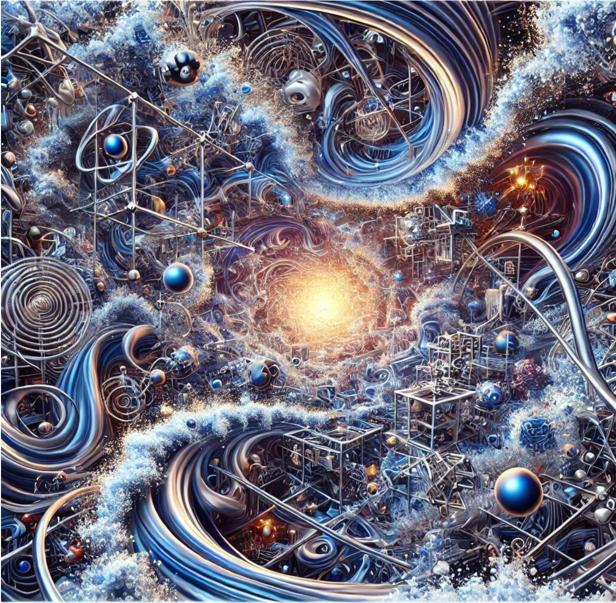
Fig 1. chaotic and intricate quantum landscape