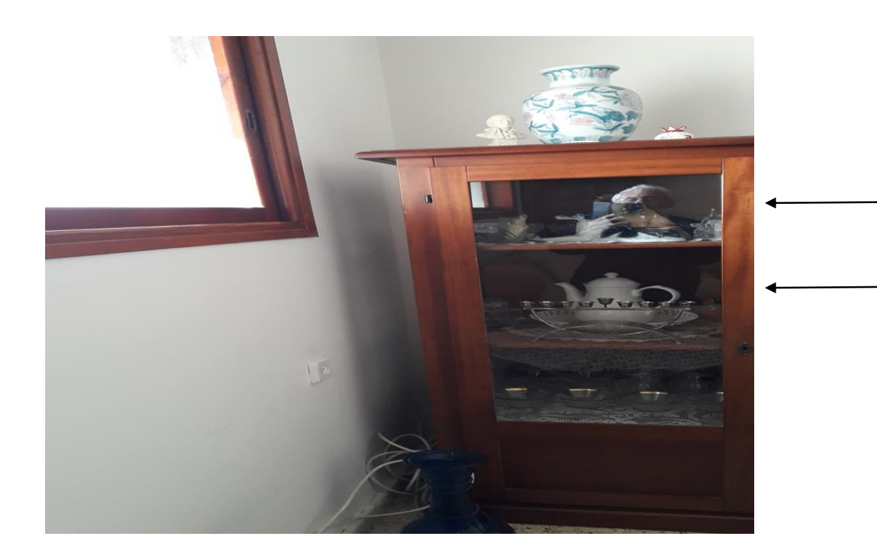
Figure 1. A Photo which might imply, that Light Beams, from separate sources, can consolidate

Thus, Figure 1 demonstrates that many light beams like "wave 2" might meet many light beams like "wave 4", and then, some of these light beams might also continue to travel on the same direction and in the same line and thus, consolidate.