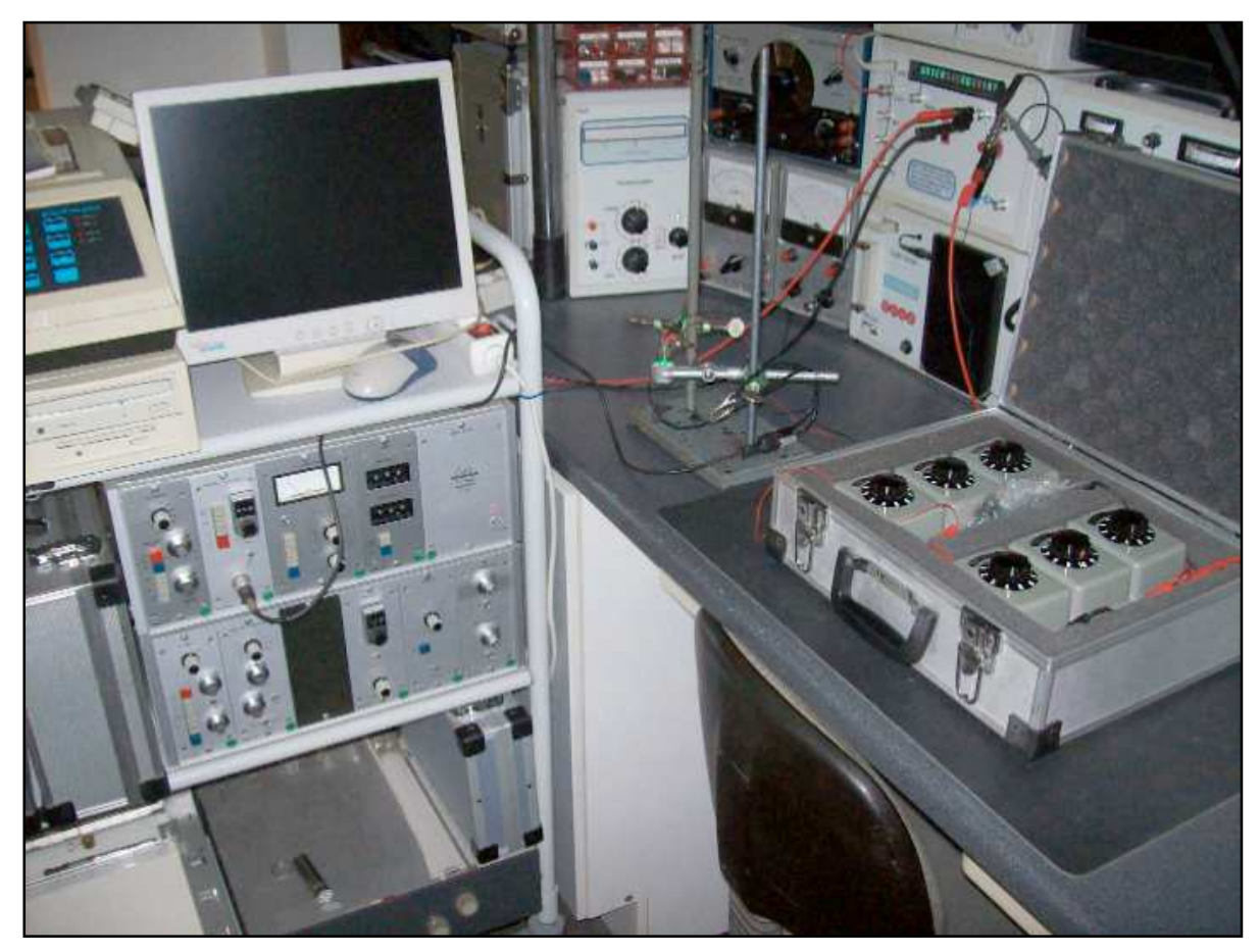
Fig. 1: Experimental Setup

The sensor is an electret microphone with \varnothing =10 mm and h=10 mm. The \varnothing =2 mm-sound hole was covered with transparent tape.