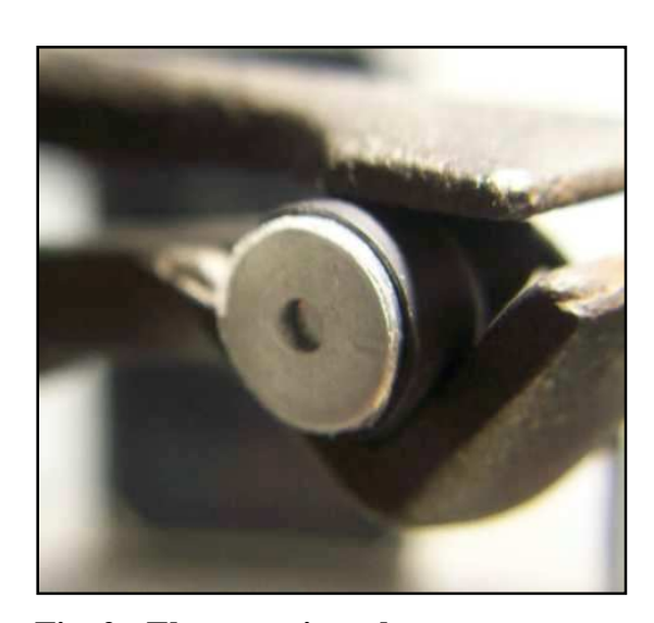
Fig. 2: Electret microphone

The hole was illuminated with a green LED flickering at 11.6 Hz. The power of the LED was specified with resistors.