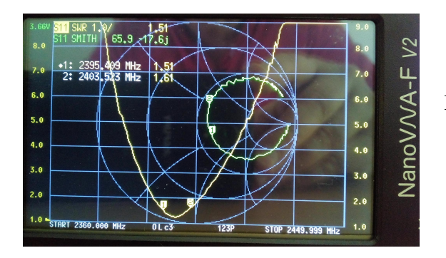
Figure 3: Display of the VNA. At resonance (2401 MHz), the SWR is less than 1.3 (yellow U-curve). The green circle shows how much the reactance changes as a function of frequency.

Many construction descriptions claim a remarkably wide bandwidth of helical antennas. This does not apply to the arrangement described above: The measured values in figure 3 show that the antenna achieves an acceptable SWR only in the small frequency range 2400 MHz \pm 3 MHz. The exact resonant frequency can be adjusted by bending the wires. To avoid incorrect measurements, it is important to repeat all measurements with coaxial cables of different lengths between the signal analyzer (Vector Network Analyzer) and the antenna. The cable length must not noticeably influence the resonant frequency or SWR.