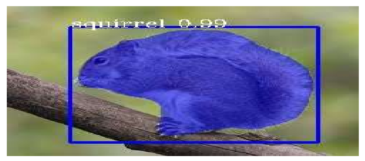
Instance segmentation with a custom model trained with PixelLib