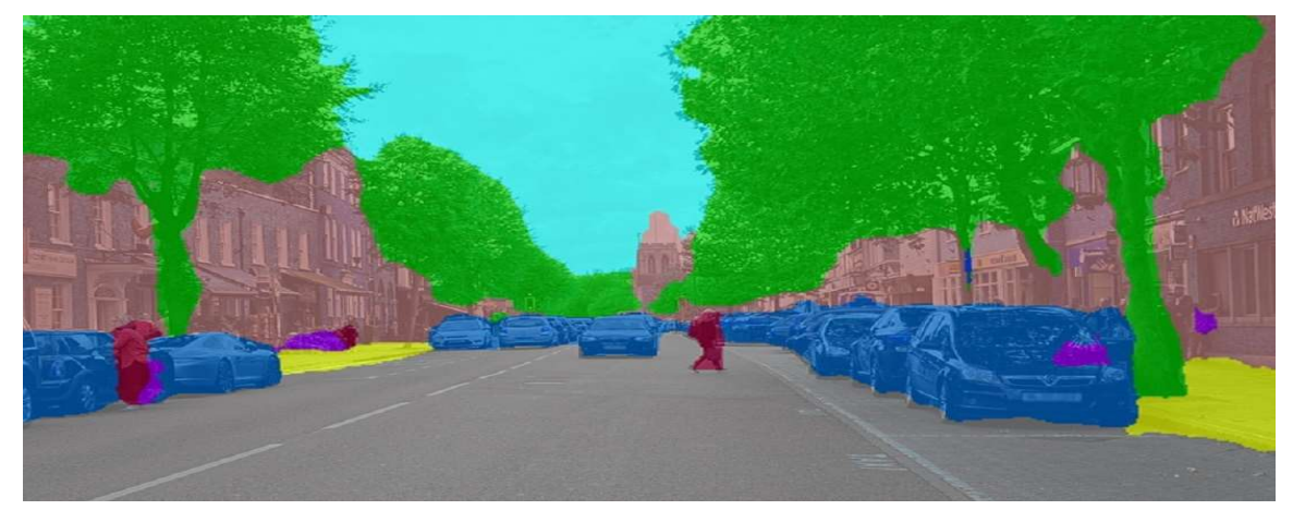
Semantic segmentation with a pre-trained Deeplabv3+ Ade20k model.