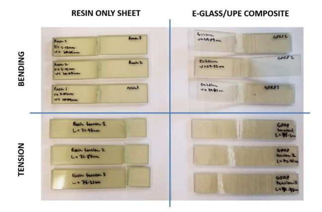
Figure 1. All four classes of samples after mechanical testing was performed.

As can be seen, the GFRP samples' failure modes consistently showed fibre-matrix disbonding and delamination (although the sample remained partially intact by the end), which was also audible throughout the latter stages of the test. Comparatively, the polymer-only samples catastrophically yielded at the point of failure and the break fully detached both halves of the samples. Following the testing, load-displacement data was collected from the load frame and evaluated. The stress-strain curves for both the tensile and bending tests are shown in Figures 2 and 3.