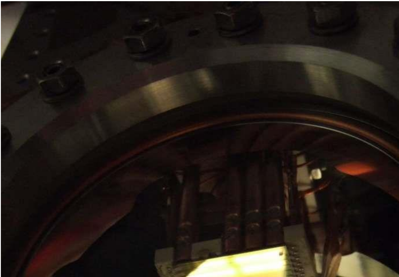
The atom chip, used to control ultra cold atom clouds.