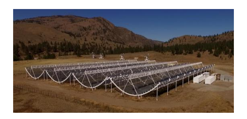
Figure 2. CHIME Telescope (https://chime-experiment.ca/)