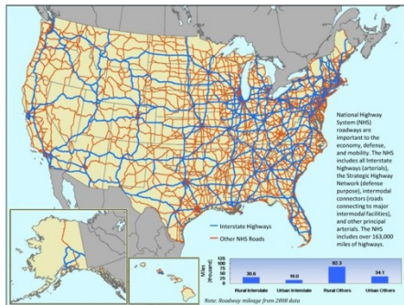
Figure 2 The increase of Black asphalt roads all over the world. Here displayed in the U.S. New pavement is getting blacker today with lower albeto.

Roads all over the world are covering the Earth with Asphalt, having very low albedo creating hot spot emissions.