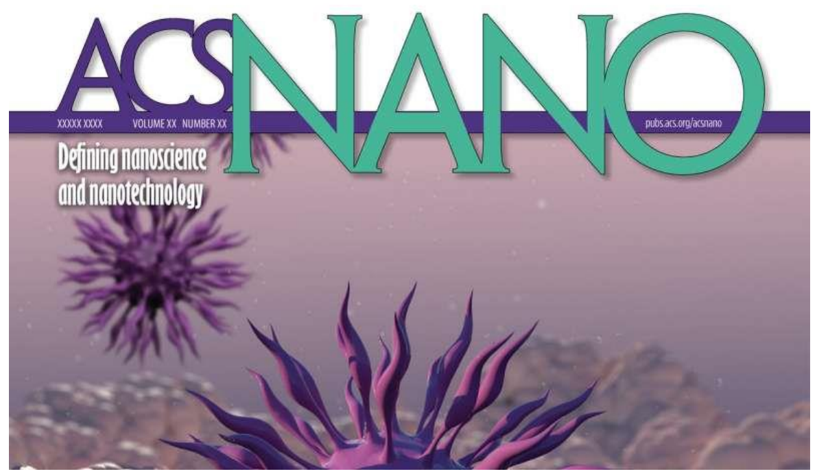
OSU researchers Olena and Oleh Taratula's work with magnetic nanoclusters as cancer therapy was featured on the cover of ACS Nano.

Olena Taratula and Oleh Taratula of the OSU College of Pharmacy tackled the problem by developing nanoclusters, multiatom collections of nanoparticles, with enhanced heating efficiency. The nanoclusters are hexagon-shaped <u>iron oxide nanoparticles</u> doped with cobalt and manganese and loaded into biodegradable nanocarriers.