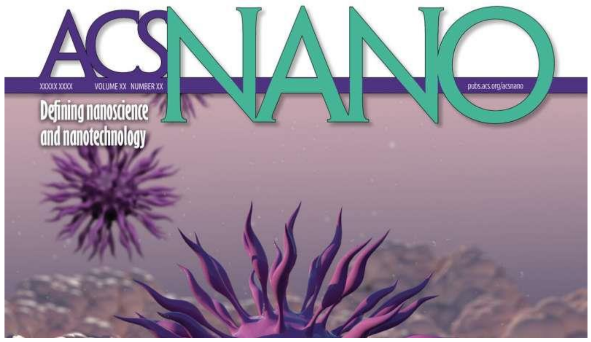
OSU researchers Olena and Oleh Taratula's work with magnetic nanoclusters as cancer therapy was featured on the cover of ACS\ Nano .

Olena Taratula and Oleh Taratula of the OSU College of Pharmacy tackled the problem by developing nanoclusters, multiatom collections of nanoparticles, with enhanced heating efficiency. The nanoclusters are hexagon-shaped <u>iron oxide nanoparticles</u> doped with cobalt and manganese and loaded into biodegradable nanocarriers.