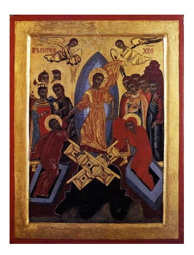
D. Chakalov Easter 2019, 15:15 GMT