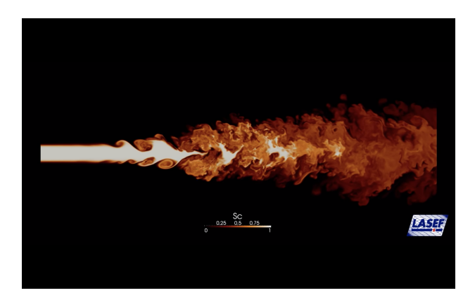
Figure 3. The number of vortices stabilize at the thirtieth second.

occurs until energy is too dispersed to form any more, and the carrying capacity of the laminar flow is reached. In other words, at such an equilibrium, the number of vortices remain the same because they collectively disperse as much energy as supplied by the laminar flow, as shown in Figure 3. This is akin to the exponential growth of the niches finally reaching an upper bound, and species only evolving in and out of a fixed number of niches. Finally, consider a sudden reduction of the laminar flow. The reduction in energy would result in a reduction of the the vortices closest to the laminar flow, and an inevitable cascade of vortex deaths. This is akin to the fallout of either asteroids or volcanic eruptions blocking the flow of heat from the sun to the earth, with dinosaurs at the end of the cascade of extinction. Moreover, falling sea-levels, an indication of global cooling, associated with all five previous mass extinctions, may be the effect of such a reduction in the energy supply from the sun one way or another. In fact, any drastic environmental change that reduces or halts any energy supply would cause a cascade of extinction, as is the case of the ongoing sixth mass extinction.