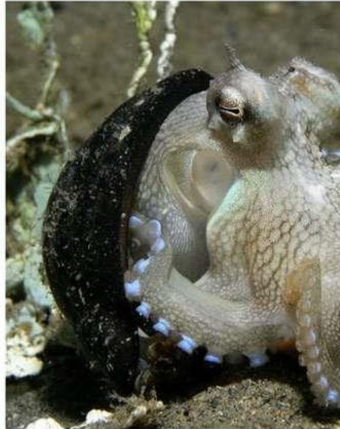
A capuchin ( Sapajus libidinosus ) using a stone tool (T. Falótico). An octopus ( Amphioctopus marginatus ) carrying shells as shelter (N. Hobgood). (Wikimedia/Tiago Falótico, Nick Hobgood), CC BY-NC-SA