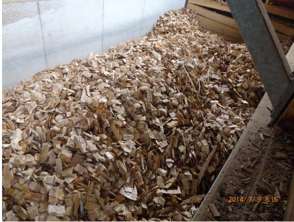
Fig. 1. Wood chips on Mainau Island.