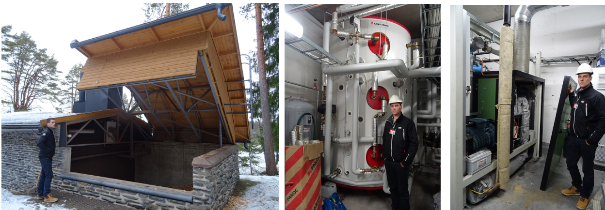
Fig. 8: Volter Oy wood gas cogenerator facilities near Kempele/Oulu/Finland. Left: hydraulic roof wood chip fuel storage. Center: warm water tank. Right: compact wood gas cogenerator. Supplying 32 residential units (see above layout drawing, blue) with total floor space of 2365 m 2 [Liikkujantie 19 2015].

The fuel supply can also be designed very practical and compact. One example is like a personal garage with a hydraulic roof (Fig. 8 left), that can be opened remotely, a wood chip truck moves in front of it, dumps its load of wood chips, and the roof is closed again remotely, thus providing supply for several weeks.