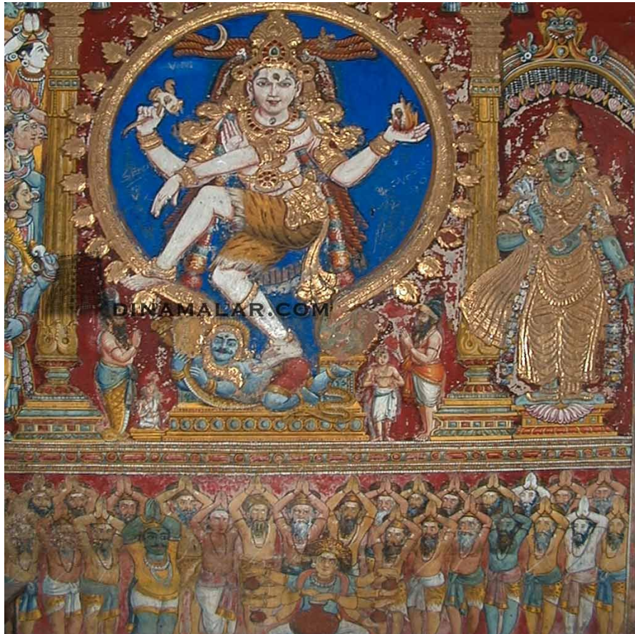
Lord Shaasta seated as Yogeshwara in Kutralam, Tamilnadu