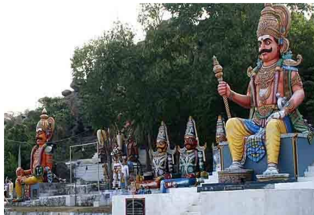
Lord Shaasta as Aiyanaar in Koodankulam, Mallur