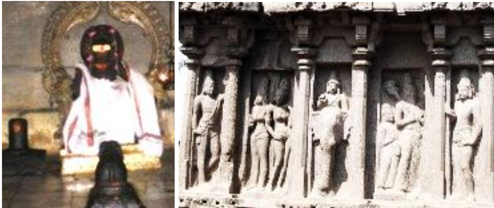
Lord Shaasta in Tirunelveli Nellaippar and Mahabalipuram Temples

However, in some temples in Kerala, one sees Lord Shaasta, not with two consorts, but with Prabha, a single Goddess embodying both aspects of Jnaana and Bhakti. The Lord is seen with the Goddess and a son, Satyaka, similar to the Shaiva Somaskanda Moorthi, which is an allusion to Truth (Satya) and Sattva Guna - the means by which one can reach the Guru and further, to Self-Realization. This form coincides with the "Santhaana Pradha Shaasta", another of the Lord's 8 incarnations, and is what one sees in many Kerala temples including the powerful Kshetra of Thrikunnappuzha which is the foremost among 108 Kerala Shaasta Temples established by Lord Parashuraama. This is also one of the forms extolled by Aadi Shankara.