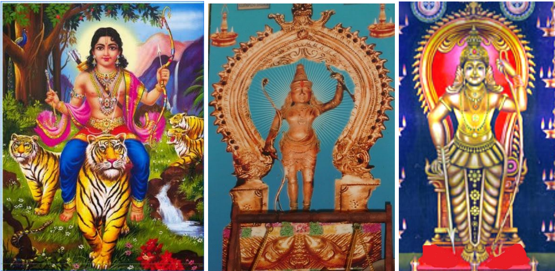
Lord Manikantan, Lord Shaasta in Kulathupuzha and Erumeli, Kerala

Among the 8 incarnations of Lord Shaasta, the representations of Aiyandar and Manikantan coincide with the Kiraatha or Veera Shaasta, shown standing tall, armed with bow and arrows. This is the form one finds enshrined in most Shaasta temples in Kerala, including Kulathupuzha and Erumeli, two of the temples of the six Chakras, as well as Kuthiran Hill, Thrissur.