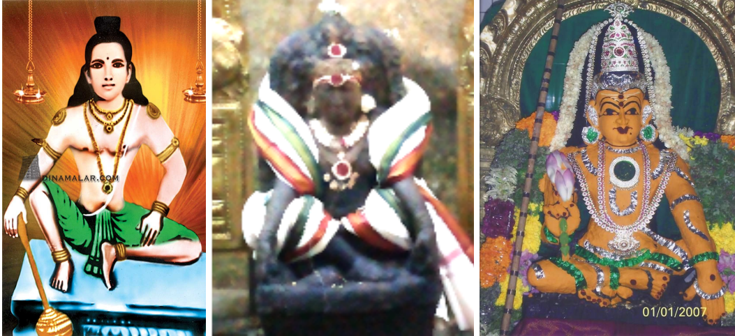
Adhisaya Shaasta, Kanyakumari; Yoga Shaasta, Kumbakonam; Duraiyappa, Korkkai

In Aadi Kumbeshwara temple, Kumbakonam, one finds a unique posture of Lord Shaasta in Yoga, with both legs crossed. Other variations of the form include a Padmaasana posture in Kollangottu, Kozhikode, as well as the Achankovil posture with legs slightly interchanged in Perumbavoor, Ernakulam.