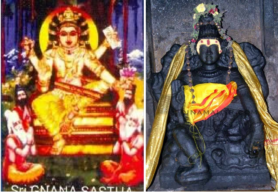
Jnaana Shaasta; Kamandala Dakshinamurthi in Cumbum, Tamilnadu