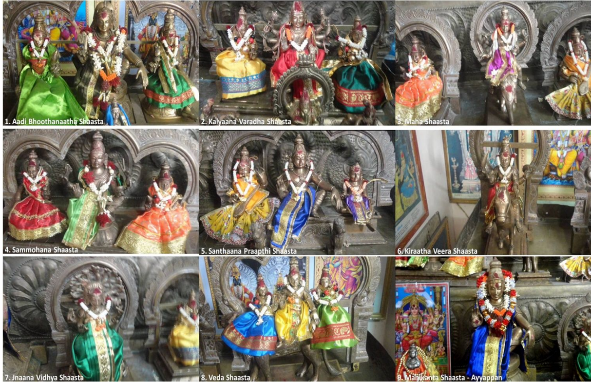
The eight forms of Lord Shaasta (Aadi Bhoothanaatha, Kalyaana Varadha, Maha, Sammohana, Santhaana Praapthi, Veera, Jnaana and Veda) with along with Manikanta