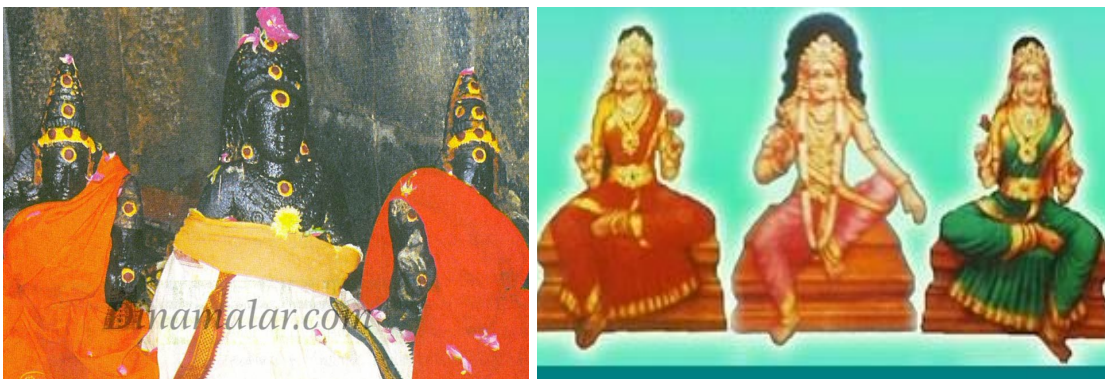
Lord Shaasta in Thirupattur, Palayamkottai

One also sees this form in Thirupattur, near Trichy, Tamilnadu, more than 1000 years old, which has sources such as the Periya Puraanam referring to the deity as “Saathanaar”. Similarly, the temple of Nadukkavudaiyar in Shanthinagar area of Palayamkottai, Tirunelveli has references in the Skanda Puraana as “Champakaraanya Goptha”.