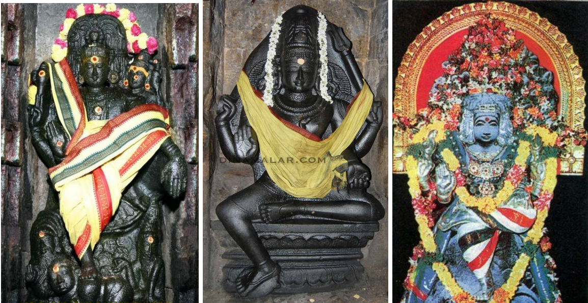
Dakshinamurthi in Suruttapalli, Thiruvaiyaru and Alangudi

In the famous temple of Thiruvaiyaru, Tamilnadu, one sees Dakshinamurthi with the Trishoola weapon - a clear Shaiva representation, while stamping on a tortoise.