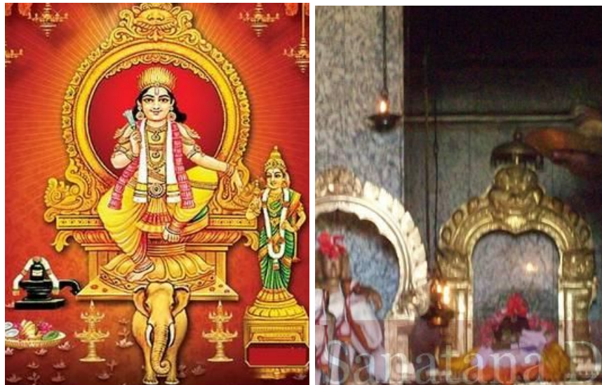
Lord Shaasta in Aryankavu, Kerala; Trayambakapuram, Kanyakumari, Tamilnadu