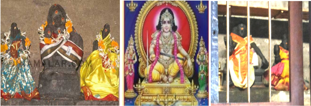
Lord Shaasta in Sori Muthaiyan Koil, Achankovil and Kanchipuram Kamakshi temple

the six Kshetras of Lord Shaasta corresponding with six Chakras, with Muthaiyan Koil representing the Mooladhara Chakra. Here, the Lord gave Darshan to the sage, while all the Devas (Gods) were showering (Soriyum) gold (Pon), and hence the original name Pon Soriyum Muthaiyan.