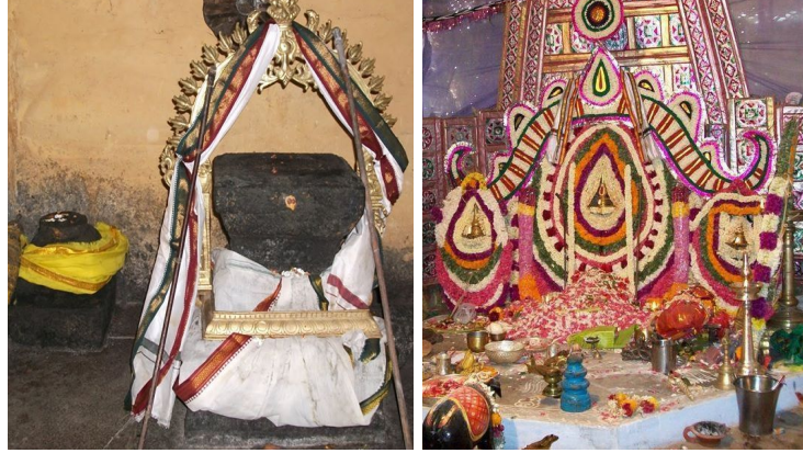
Shaasta as Peetham in Kulathooril Ayyan, Karanthapuri, Tamilnadu