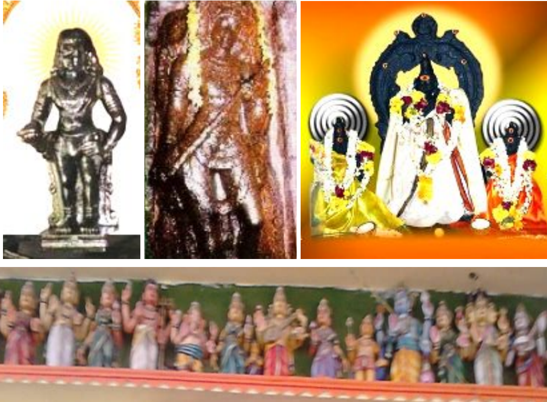
Poonjar Shaasta, Lalgudi Veena Dakshinamurthi; Melapattam Vidya Shaasta

The next stage in the transition is seen as the eschewing of the Veena aspect retaining the pure Jnaana aspect alone with the generic name of Dakshinamurthi. In the Shaiva-Vaishnava temple of Cumbum, Tamilnadu enshrining Kashi Vishwanatha-Kambaraya Venkatesha, one can see the shrine of 'Kamandala Dakshinamurthi', very similar to the Veerasana posture of Dharma Shaasta including the band (Verea Pattai), as well as left hand pointing towards the Lord's feet.