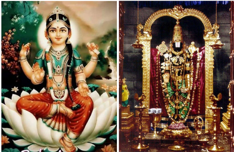
Baalaa Tripura Sundari, Lord Venkatesha of Tirumala

The Lord is seen as non-different from Lalitha Ambika, and residing in the heart of the Universal Mother, and thus non-different from Baalaa Tripurasundari, the young playful aspect of the Goddess of 9 or 16 years of age, and as the most powerful of Mantras for the Kali Yuga. Also, Baalaa is seen as the most important form of the Goddess for the present Kali Yuga - "Dvaapare Shiva Bhedam Cha Trethaayaam Vaamanam Harim Atha Kaliyuge Shasthaa Yaa Baaleti Nigadyate".