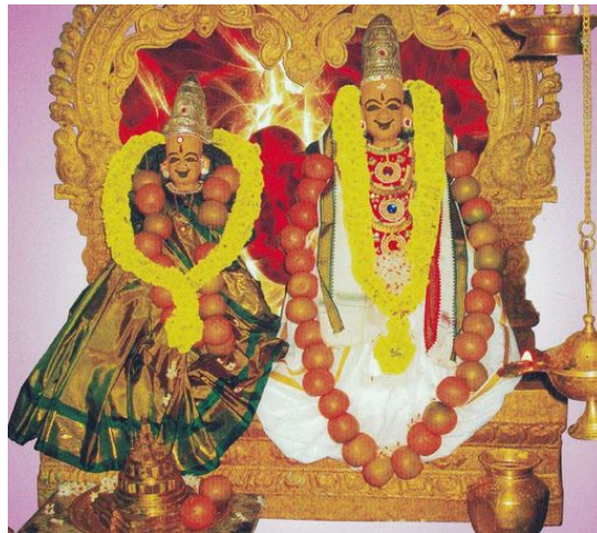
Aadipuram Narasimha Shaasta with Meru

As the overlord of Bhoothas, Shaasta is also the overlord of incarnations, where every incarnation of every deity that manifests on the earth is required to obtain the permission of Shaasta prior to the venture. It is in this line that one finds the temple of Narasimha Shaasta in Aadipuram, Tuticorin, where Lord Narasimha is seen offering the first worship to Shaasta and then to Himself.