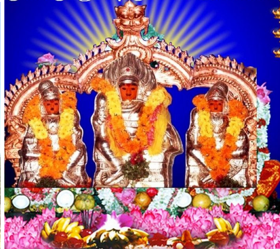
Lord Aiyanaar; Karkuvel Ayyanar