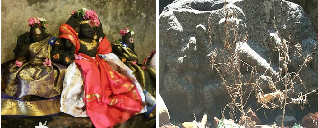
Lord Shaasta in Thanjavur Brihadeeswara and Thiruvavur Thyagaraja Temples

One finds similar forms of Lord Shaasta with or without consorts in almost every major temple in Tamilnadu, irrespective of region such as Chera, Chola, Pandya or Pallava. Examples include Kanchipuram, Thanjavur, Madurai, Tirunelveli and Rameswaram. In Thiruvavur itself, one understands the existence of another Lord Shaasta shrine in Thyagaraja Praharam, installed possibly by Chola King such as Manu Needhi, for success in conquests. However, the shrine is no longer in existence, and a new form of the idol now exists in "Panaiyadi Ayyanar Temple", few hundred metres away from the main temple. So too, in Mahabalipuram, Tamilnadu, one finds Shaasta astride an elephant (Gajaaroodham) flanked by Poorna and Pushkala.