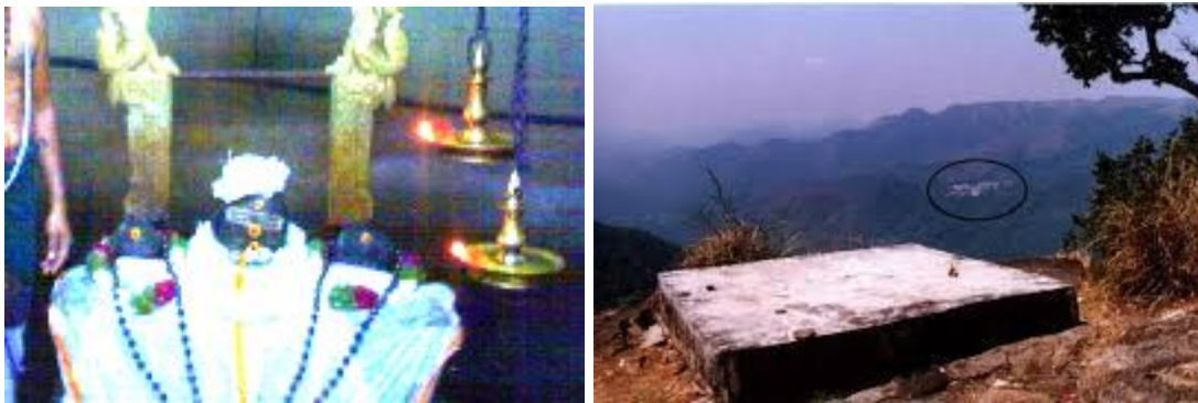
Shaasta as Lingam in Rajakkalmangalam, Peetham in Ponnambalamedu