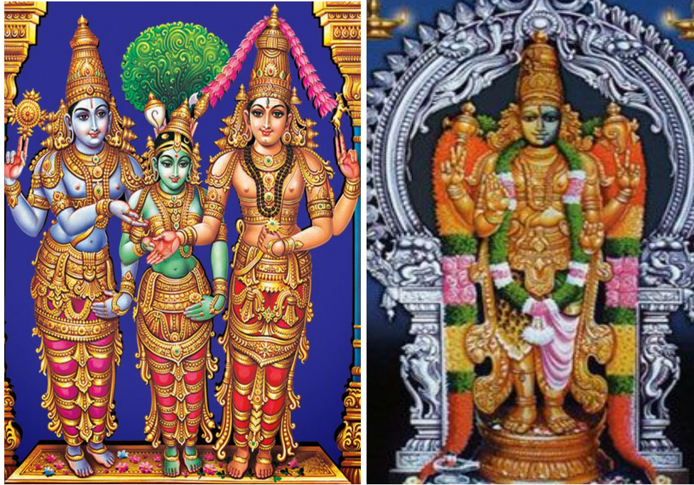
Maayon-Shakti-Shiva; ShankaraNarayana in Shankarankovil, Tamilnadu

Then comes an interesting stage, as an intermediate between Saguna and Nirguna. To do this, the vertical Saguna-Nirguna duality must assume a horizontal duality. For this, Maayon, along with Shiva and Shakti combine to form a single Saguna aspect, called 'Narayana', and this union takes the place of Shakti. This is the basis of associating Maaya, which is Maayon, as Yoga Maaya or Maha Maaya, the Goddess (Keralites often chant Amme Narayana). Nirguna on the other hand conflates taking the place of Shiva. At this point, Shiva, as Arunachala transcends form and emerges as a tall pillar of fire (The 'Formless Form' of Lingam), and is now called Shankara.