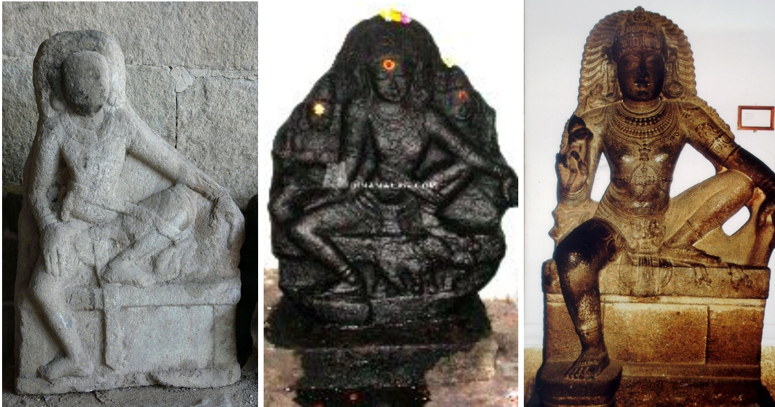
Lord Shaasta in Kudumiyanmalai, Suruttappalli; from Chola period in Chennai Museum

One also observes other variations in the form such as right hand resting on the thigh rather than holding anything, seen in Kudumiyanmalai, Tamilnadu and Suruttappalli, Andhra Pradesh. Also, Lord Shaasta appears with interchanged position of left and right legs in Adhishaya Shaasta, Kanyakumari, Tamilnadu.