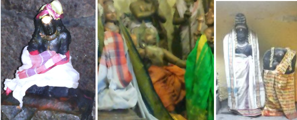
Moolavar, Utsavar and Bhoothanaatha Shaasta, Swamimalai

Finally, one observes that the name “Shaasta” occurs in the Dakshinamurthi and Medha Dakshinamurthi Sahasranaamas, whereas “Dakshinamurthi” occurs in Hariharaputra Shaasta Sahasranaamam, assertively confirming that Shaasta, the Guru is indeed Dakshinamurthi.