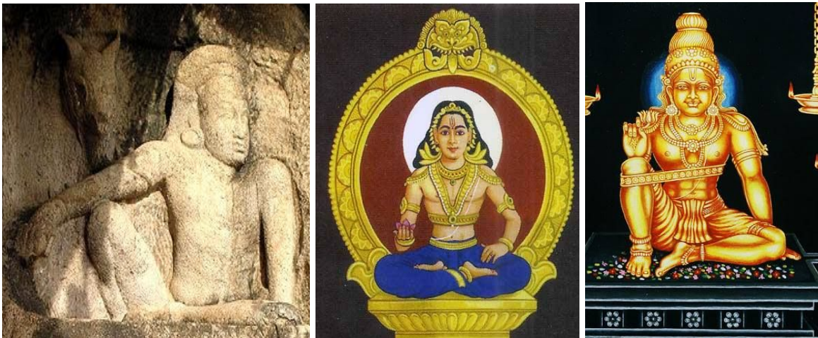
Lord Shaasta in Sri Lanka, Kollangottu and Perumbavoor

In Aadi Kumbeshwara temple, Kumbakonam, one finds a unique posture of Lord Shaasta in Yoga, with both legs crossed. Other variations of the form include a Padmaasana posture in Kollangottu, Kozhikode, as well as the Achankovil posture with legs slightly interchanged in Perumbavoor, Ernakulam.