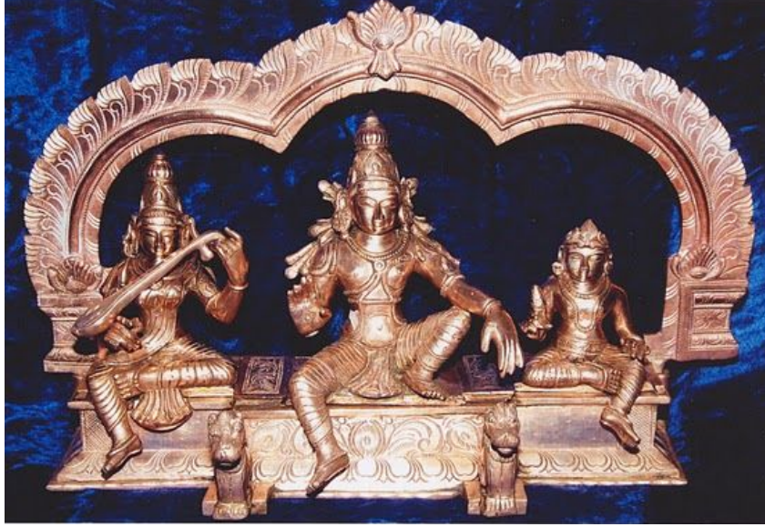
Lord Santhaana Pradha Shaasta with Prabha and Satyaka

As the overlord of Bhoothas, Shaasta is also the overlord of incarnations, where every incarnation of every deity that manifests on the earth is required to obtain the permission of Shaasta prior to the venture. It is in this line that one finds the temple of Narasimha Shaasta in Aadipuram, Tuticorin, where Lord Narasimha is seen offering the first worship to Shaasta and then to Himself.