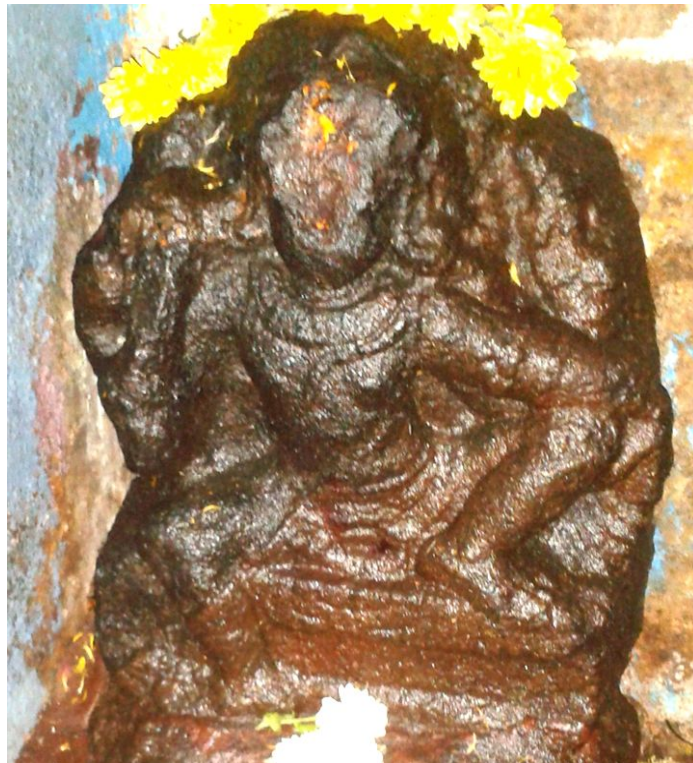
Lord Shaasta in Thiruvvarur

Thus, even though possessing Wisdom and Righteousness aspects, the Lord is almost always enshrined in Vedic and Sri Vidya contexts in the position of Guru, guiding the devout towards Self-Realization. This earliest representation of the Lord as Shaasta, is seen mainly in two temples: