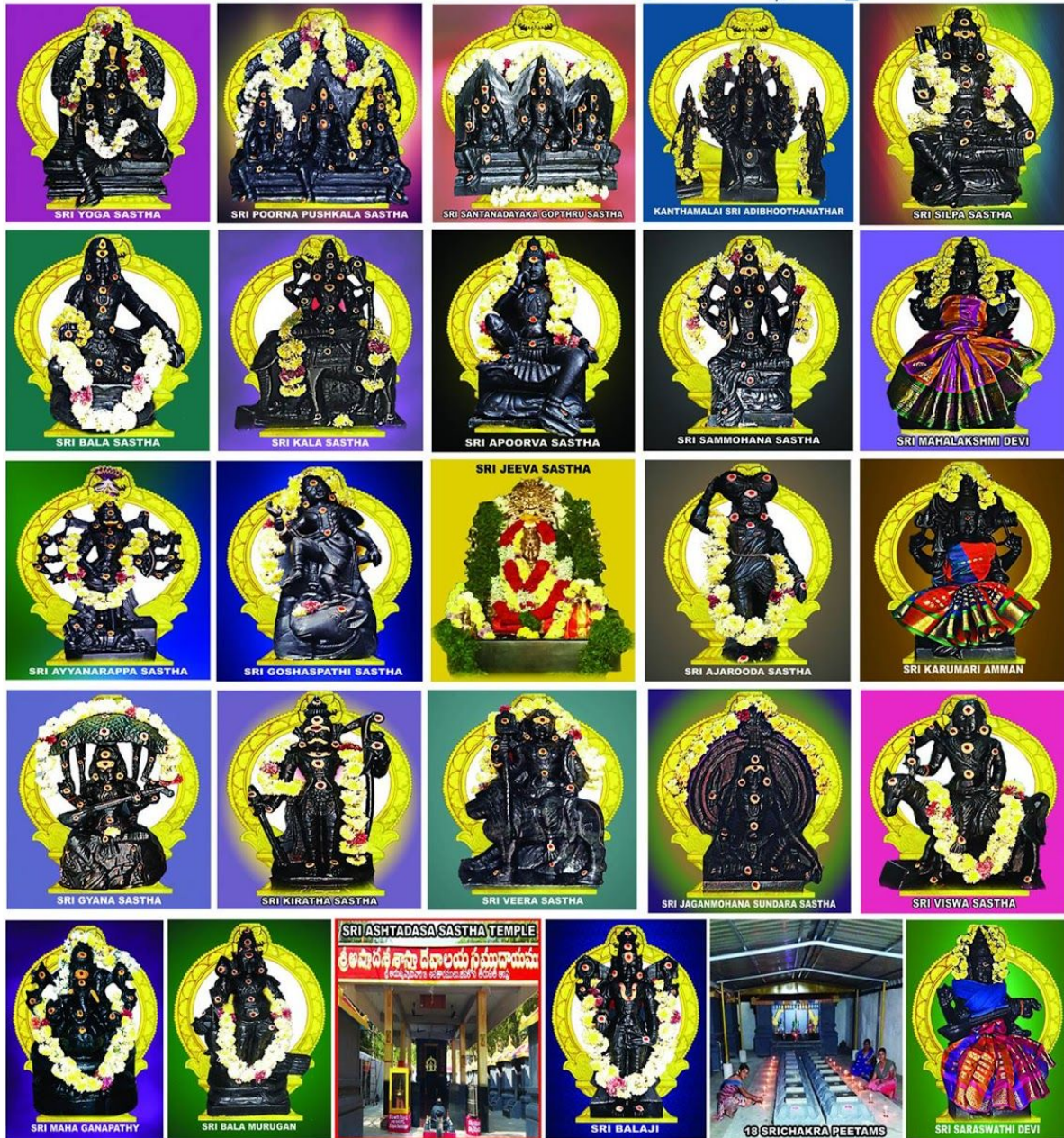
18 forms of Lord Shaasta in Ashtadasa Shaasta temple, Jeevakona, Tirupati