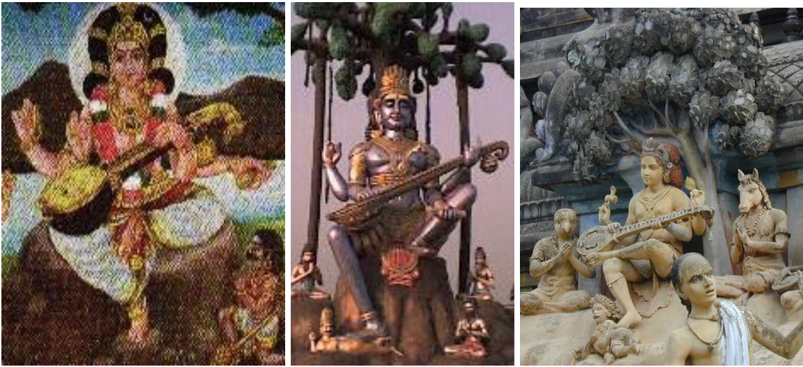
Sri Vidya Shaasta, Veena Dakshinamurthi and Kuthalam, Tamilnadu

The key element enabling such transition was the form of Lord Dharma Shaasta as Jnaana or Vidhya Shaasta, seen as another among the 8 incarnations. This representation shows the Lord seated under a banyan tree, holding the book and the musical instrument Veena, and surrounded by disciples, and praised in invocation (Dhyaana) as South (Dakshina) facing. This representation came to be known in due course as a completely new name - Veena Dakshinamurthi. The Dhyaana Mantra of Jnaana Shaasta goes as “Om Veena Pustakadhara Dakshinamoorthi Shaastre Namah”.