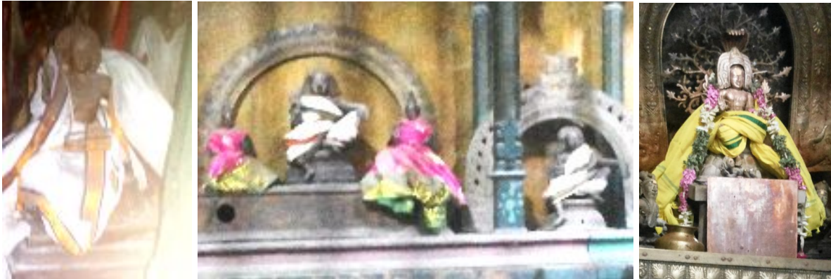
Utsava Moorthis of Alangudi Guru Kshetra

In fact, in the Guru Kshetra of Alangudi, for the Dakshinamurthi Moolavar idol, one sees four Utsava Moorthis of Lord Shaasta, in Aadi Bhoothanaatha, Kalyaana Shaasta, Adaikkalam Kaattha Shaasta and Vidya Shaasta forms.