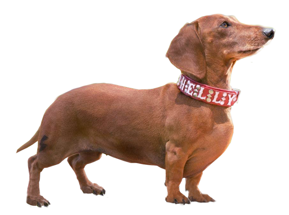
FIG. 3. Wiener dog.

the data to interspecies evolution is questionable. However, we will grant this and continue to analyze the typical case: over a very, very long time the animal gains so many positive changes that it becomes a new species and all Nature's animals, even the silly ones (figure 3), came from that.