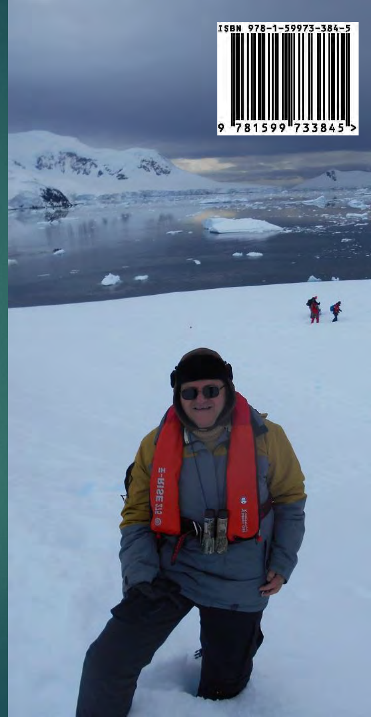
This album is a photolog of a cruise made by the author with the ship "Plancius" in the empire of whiteness which is Antarctica.