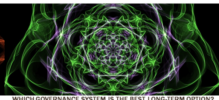
WHICH GOVERNANCE SYSTEM IS THE BEST LONG-TERM OPTION?