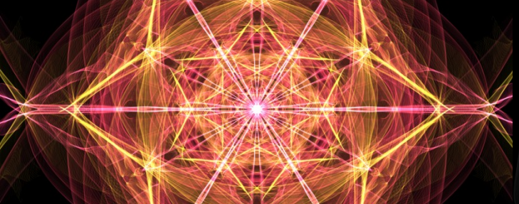
ARE ALL CIVILIZATION FUNDAMENTALLY LEMURIAN?