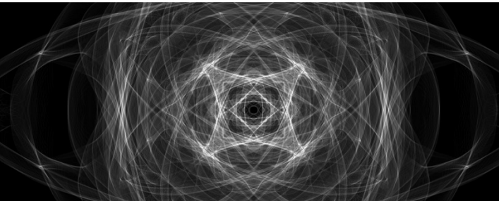
HOW DOES ANONYMITY CHANGE PEOPLE'S BEHAVIOR?