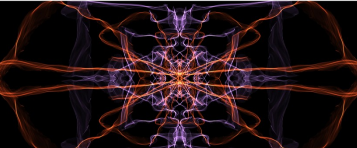
CAN AKSHARA YOGA YIELD BETTER FINANCIAL STRATEGIES?