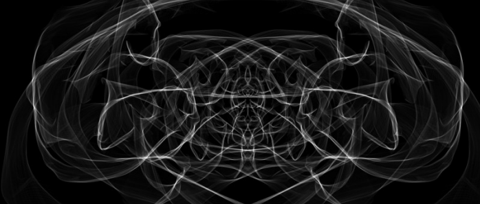
HOW WILL THE WORLD ADAPT TO PAN-NATIONALISM BASED ON AKSHARA ENERGISING SITES?