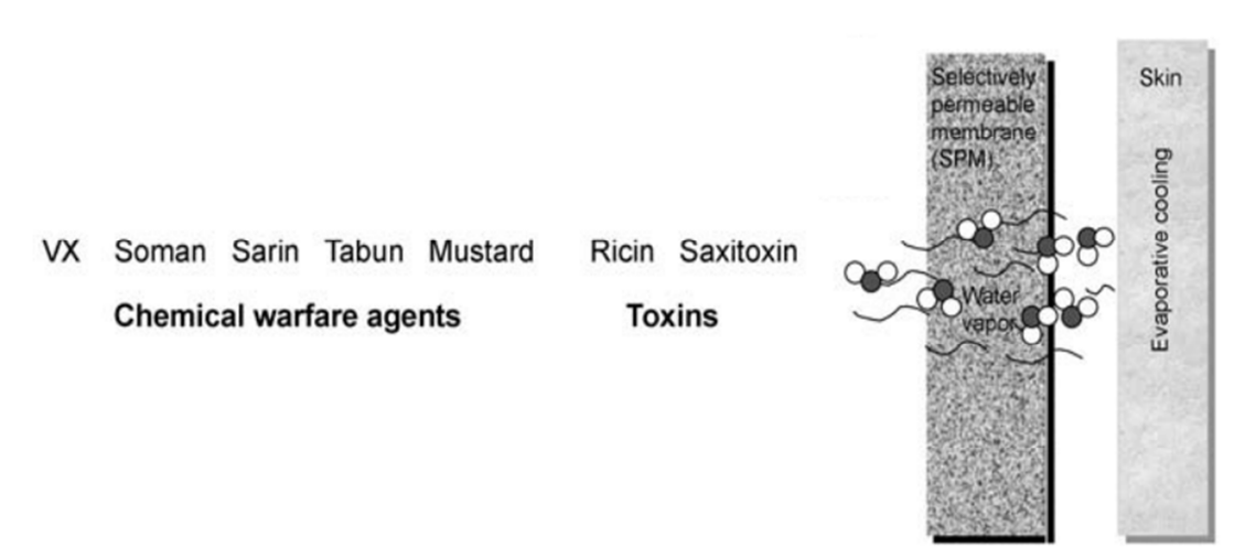
Figure 2. SPM material concept.

the chemical industry in gas separation, water purification, and in medical/metabolic waste filtration [30]There have been many different material technologies co-developed by industry and the US Army Natick Soldier Center (NSC). SPMs consist of multi-layer composite polymer systems produced using various different base polymers such as cellulose, polytetrafluoroethylene (PTFE), polyallylamine, polyvinyl alcohol, among other gas or liquid molecular separation membranes. W.L. Gore & Associates, Inc., Texplorer GmbH, Dupont, and Innovative Chemical and Environmental Technologies (ICET), Inc. are among the leading companies that have been pursuing SPM developments with NSC.