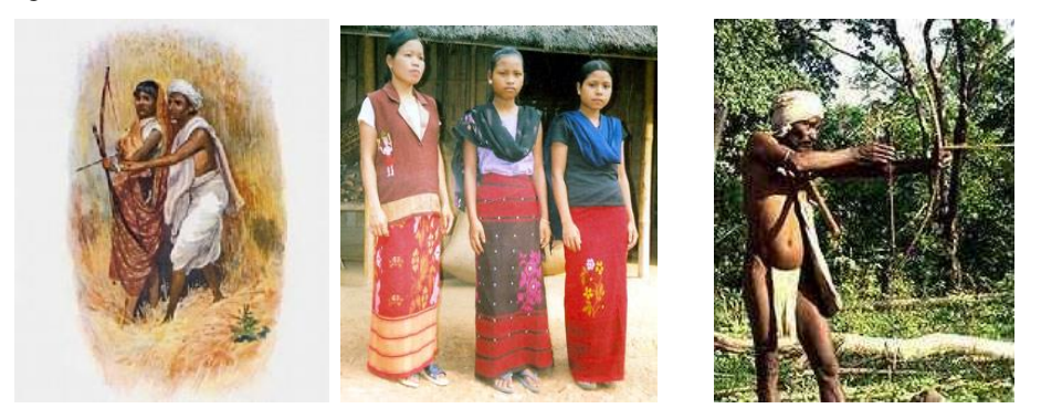
Figure 1: Tribals at different level of their cultural evolution

Sometimes it even leads to the problem of Naxalism. This is largely due to the unawareness among the tribals about their rights, privileges and economic value. ICT may help in filling this gap and therefore our discussion is restricted in this paper to the use of ICT for the improvement of livelihood of tribals in India. There is a section of society who are replacing thier IT gadgets every three months whereas there are these 8.1% populations, a majority of them have not even seen a computer. There is an urgent need to not only fill this e-gap but also to work on methodology to make this technology usable for the upliftment of the tribals.