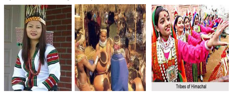
Figure 2: Tribals at comparatively more evolved level

ICTs are technologies offering new ways for communicating and exchanging information and knowledge. It can be used to enable, strengthen and empower the long deprived tribal community in India. The paper is organized in five sections. Section 2 describes as what steps would be required to introduce ICT in tribal area and how it can be made usable for tribal people. The perceived impact of ICT on the life of tribals is explained in the Section 3. Section 4 contains the details about the possible constraints and limitations that might be faced during initial stage of introducing ICT in tribal area because of the culture of isolation followed by many tribes. The paper is finally concluded in the Section 5.