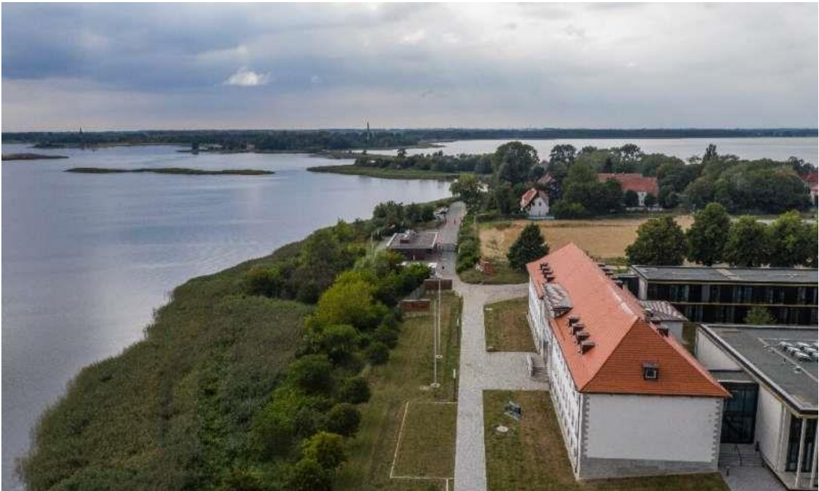
Founded by Friedrich Loeffler in 1910, the institute is the world's oldest centre for the study of viruses