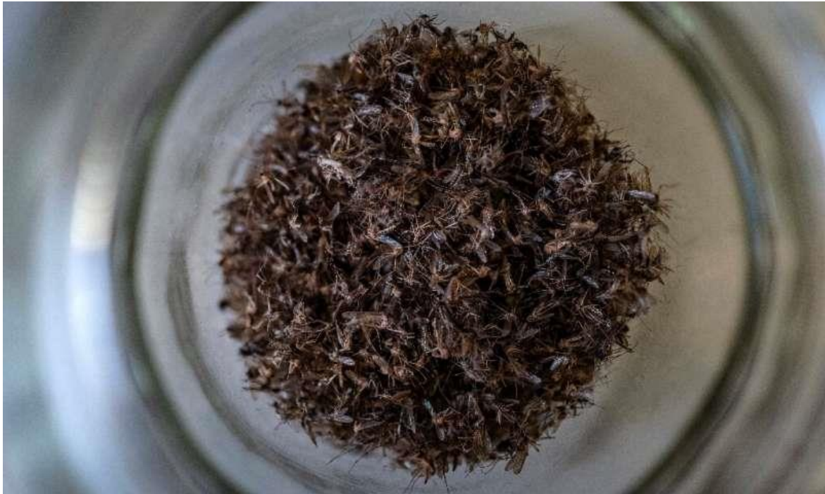
A jar full of dead mosquitoes at a lab researching mosquito-borne diseases at the Friedrich Loeffler Institute