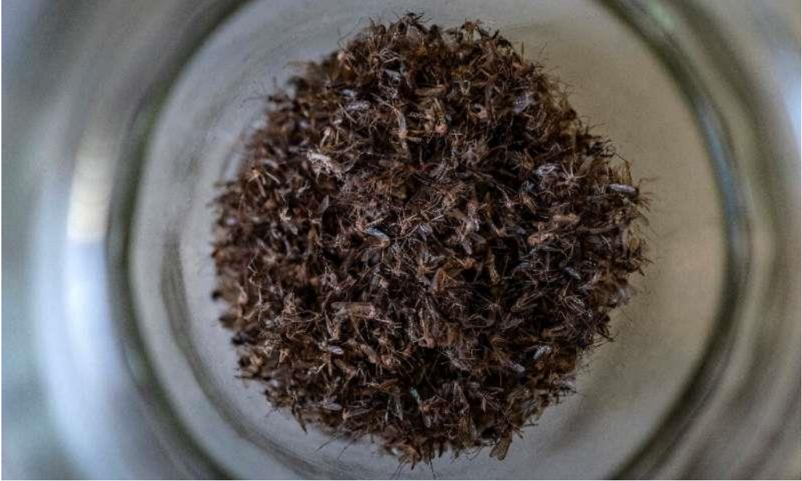
A jar full of dead mosquitoes at a lab researching mosquito-borne diseases at the Friedrich Loeffler Institute