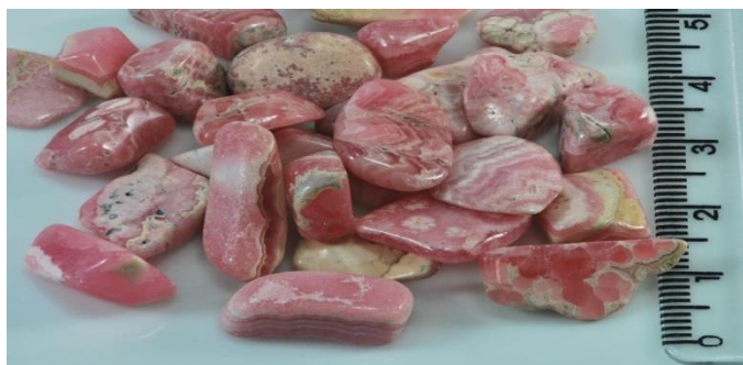
Fig. 1: Rolled Rhodochrosite from Argentina. Ruler in Centimeters [6].

But other crystals such as rhodochrosite also have piezoelectric properties. The rhodochrosite as crystal oscillator for being an alternative to those of quartz. The rhodochrosite ( \text{MnCO}_3 ) shows complete solid solution with siderite ( \text{FeCO}_3 ), and it may contain substantial amounts of Zn, Mg, Co, and Ca. The Kutnohorite [ \text{CaMn}(\text{CO}_3)_2 ] is a dolomite group mineral intermediary between rhodochrosite and calcite. [3 - 5]