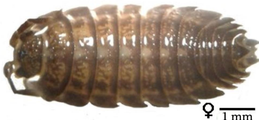
Figure 2. Habitus of female individual of Calycuoniscus goeldii collected in the state of Piauí (Picos), northeastern Brazil.

directed backwards, brown color with light spots (Figure 2) and cephalothorax with median and lateral lobes with triangular shape and straight sides.