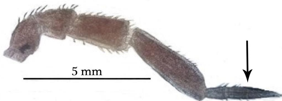
Figure 3. Antenna with thin suture between the second and third articles of female individual of Calycuoniscus goeldii collected in the state of Piauí (Picos), northeastern Brazil.