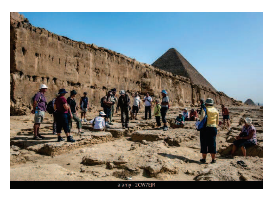
FIGURE 3. Picture of the Limestone quarries on the Giza plateau.