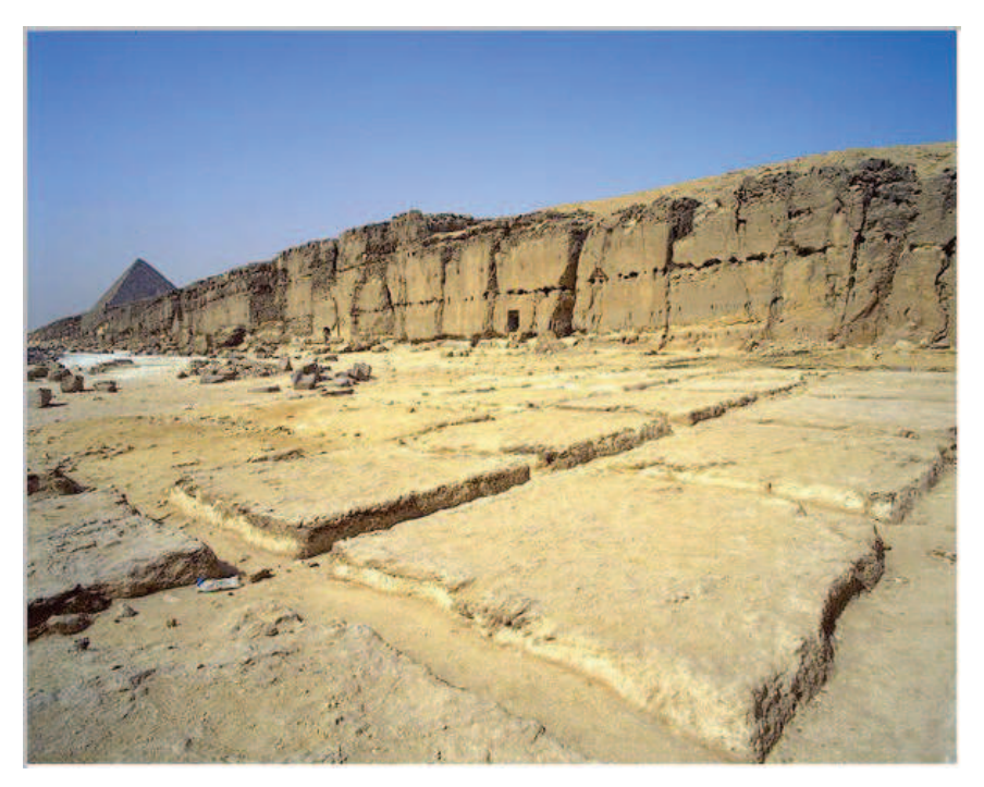
FIGURE 4. Picture of the Limestone quarries on the Giza plateau.