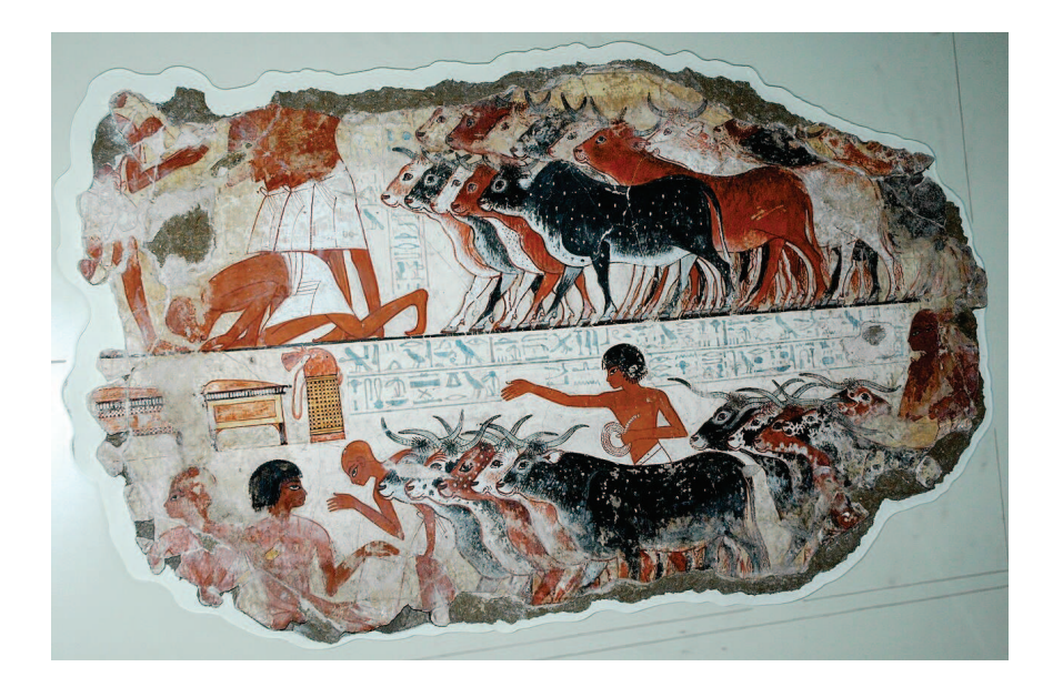
FIGURE 5. Domesticated Cattle are very useful to pull the pyramid blocks. Especially when the instantaneous pulling force is very large. In the ancient Egypt civilization, the cattle has been domesticated much before the construction of the great pyramid of Giza. Ancient Egyptian cattle were of four principal different types : long-horned, short-horned, polled and zebuine. The earliest evidence for domestic cattle in Egypt is from the Faiyum region, dating back to the fifth millennium BC.