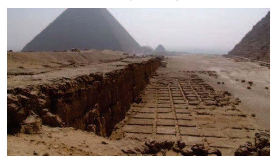
FIGURE 2. Picture of the Limestone quarries on the Giza plateau.