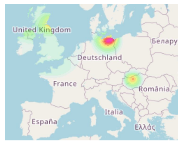
Figure 1: PhyloGeographer Yseq R-A8053 Heatmap<sup>vii</sup>

b. Norway's Hordaland coast was settled by Germanic Western Corded-Ware tribes of the South Baltic having R-A8053 Ydna.