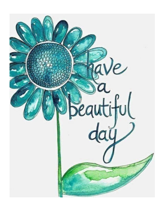
Illustration 1. Yes to life means to find beauty in each day that God giveth

For in this grand choreography, each step, each breath, each note becomes a testament to the interconnectedness of all things, a joyful affirmation of our belonging to the eternal symphony of existence.