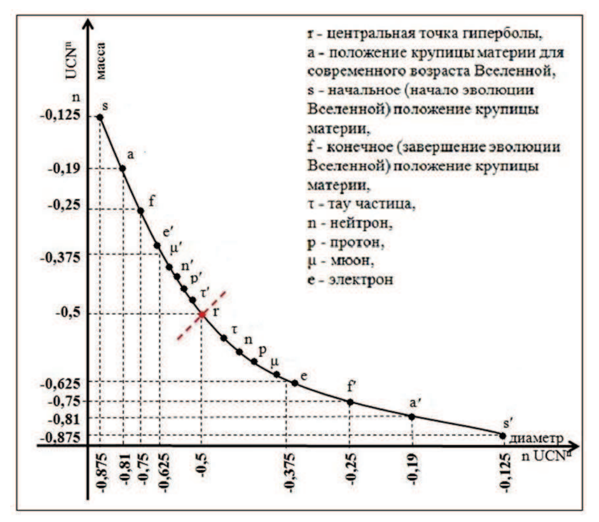
Fig. 1. Graph of the arrangement of five elementary particles.

are variable. The diameter of a grain of matter changes with time. Over time, the diameter of grain of matter (aka quantum of length, EUL) increases according to a certain law. This law has been established and opened within the framework of the "Theory of Nature" (TN). This is the fundamental law of our universe, the main law of the evolution of our Universe. This change quantum of length has its own finite limits. There is a starting value and there is a finishing value for the diameter of a grain of matter (quantum of length, EUL). These values correspond to the