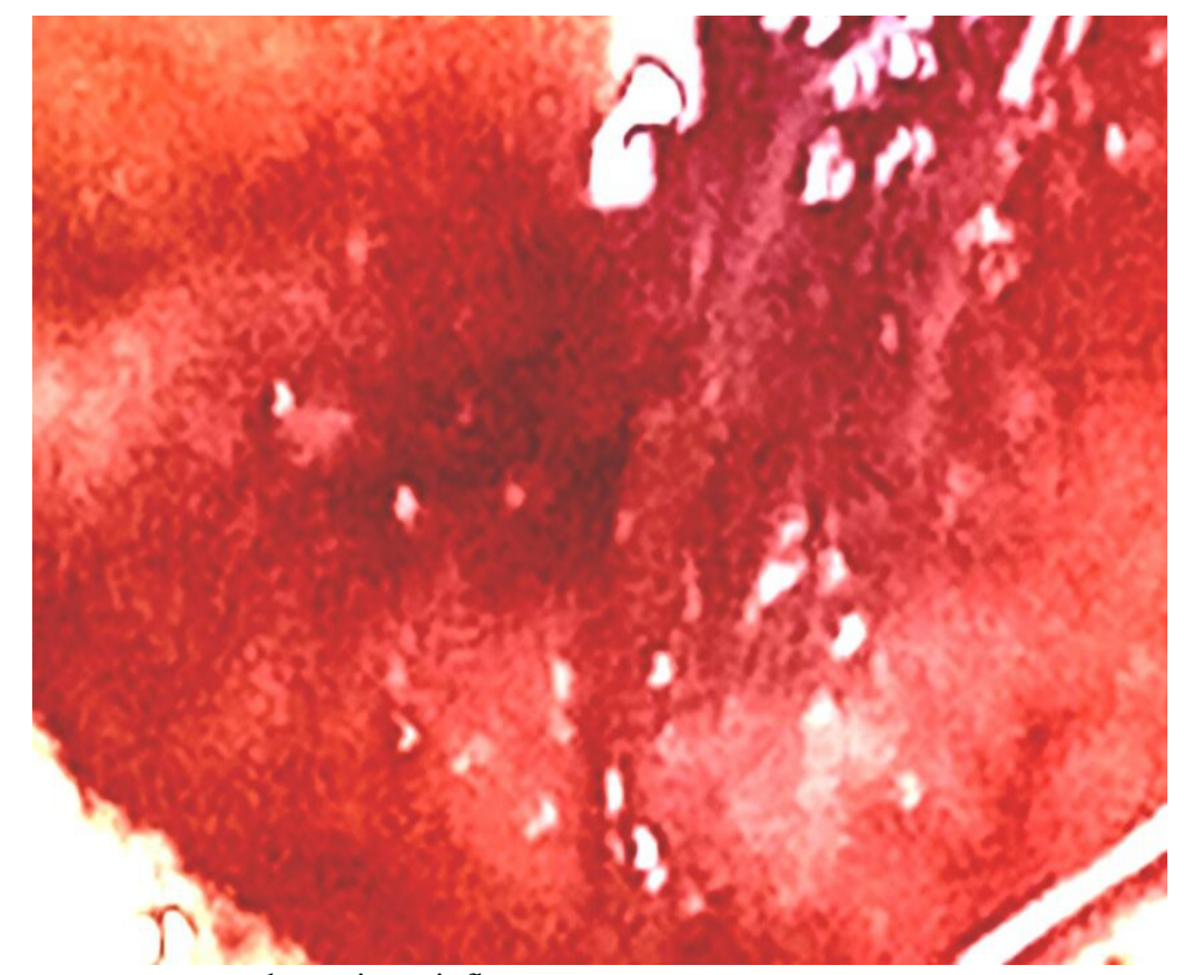
membrane in an inflammatory state