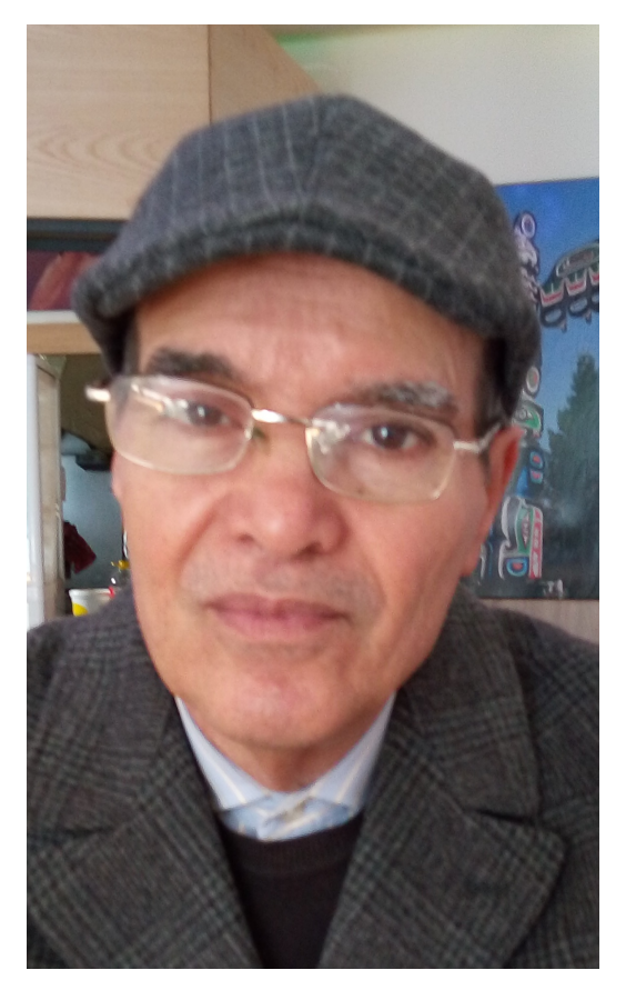
Figure 1: Photo of the Author