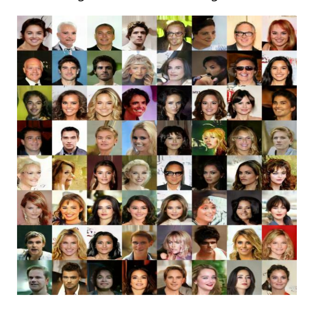
Figure 2. Generated images with R1 regularization and DV regularization

The following figure shows generated image with R1 regularization and DV regularization.