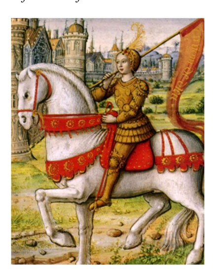
Figure 1. Joan of Arc illustration from 1505 manuscript. Figure adapted from [1].

Scripture is full of God's intervention, a wonderous example is (Josh. 6:1-5); "the LORD said unto Joshua ... I have given into thine hand Jericho ... compass the city, all ye men of war, and go round about the city once. Thus shalt thou do six days ... seven priests shall bear before the ark seven trumpets of rams' horns: and the seventh day ye shall compass the city seven times, and the priests shall ... make a long blast with the ram's horn, and when ye hear the sound ... the people shall shout with a great shout; and the wall of the city shall fall down flat'.