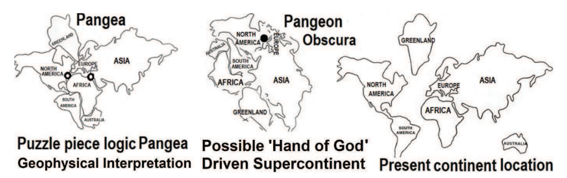
a) Geophysical based Pangea neglecting need for Jerusalem and Zion to be united. b) Simplistic Pangeon Obscura illustrating unity of Jerusalem and Zion. c) Current continent positions.

Through the prophet Joseph Smith, the Lord hinted at a Pangeon Obscura-like Peleg configuration. Using the puzzle-piece model the author confabulated one possible design incorporating essential gospel components – Jerusalem (Word) and Adam-ondi-Ahman (Law) becoming united in one.