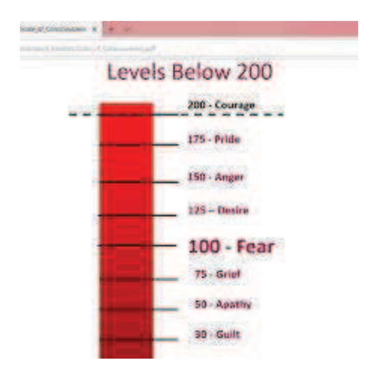
Ilustration 1. (Below 200) Scale of Consciousness according to Prof. David Hawkins

The core of the theory of the scale of consciousness is roughly as follows: that human consciousness continues to develop and process, if it is still below 200, then someone will still be controlled by hate, jealousy, shame, worry, fear, etc. However, if a person moves to a scale of consciousness above 200, then he will begin to recognize courage, peace, joy, and so on. Then if you reach level 500 and above, you will practice love, and when you are above 700 you will experience enlightenment.