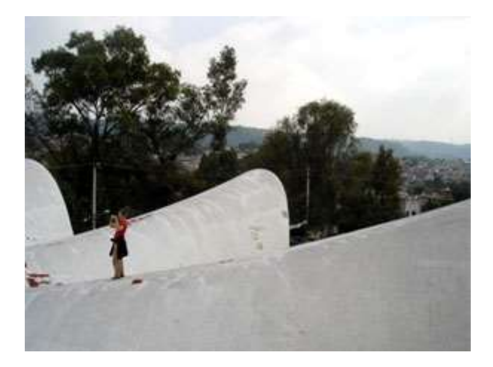
Illustrations 1-3. Several key designs of Felix Candela