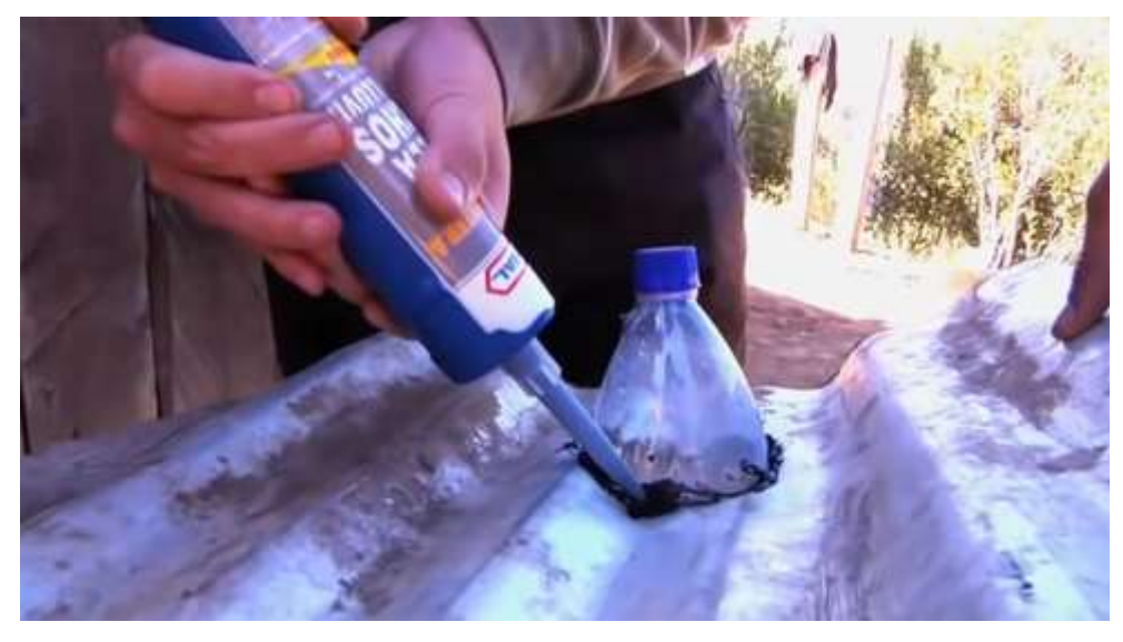
Figure 5. Installation process of Moser lamp (8)