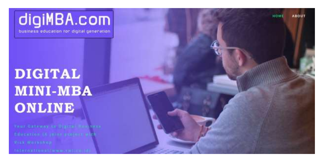
Figure 1. Landing page of DigiMBA.com