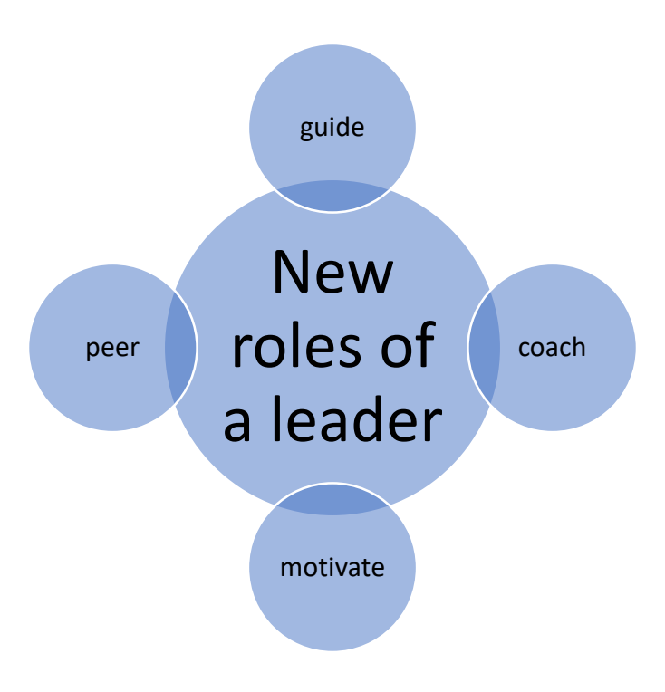
Diagram 2. New roles of a leader (The New School)

Therefore, a leader should learn to adapt to new environment driven by better and more equal communication, in order to become effective in his/her transformative role.