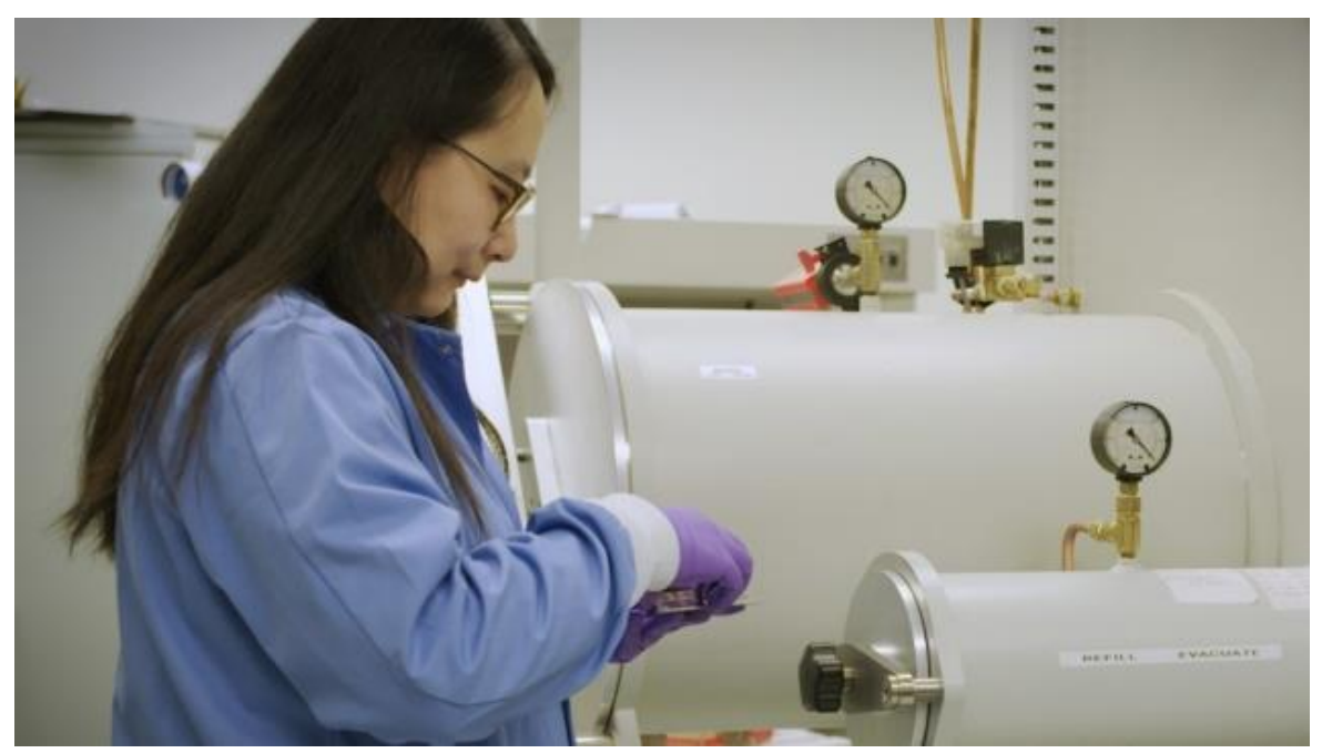
Wanyi Nie, a physicist who leads perovskite device development at the Los Alamos National Laboratory, holds a prototype X-ray detector produced in her lab.

Based on the perovskites' strong X-ray absorption, the researchers next assessed the current density–voltage characteristics of a thin-film p-i-n detector (with the structure: indium tin oxide/p-type contact/2D-RP thin film/n-type contact/gold) fabricated using a 470-nm 2D-RP thin film. As a reference, they also tested a commercial silicon p-i-n diode (600 \mu m thick) under the same conditions.