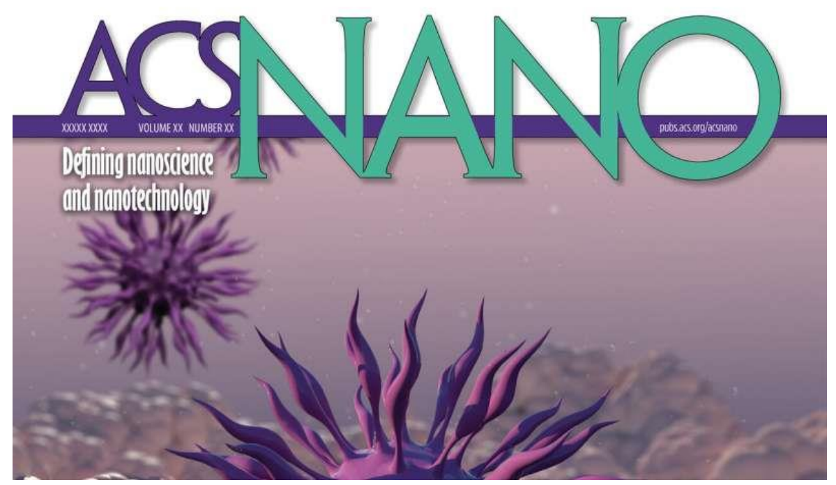
OSU researchers Olena and Oleh Taratula's work with magnetic nanoclusters as cancer therapy was featured on the cover of ACS Nano.