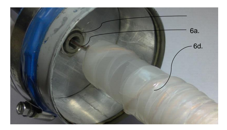
female Image 2: N-type bulkhead (2h.), aerial wire leading to solenoid (6a.), proxy-aerial (6d).