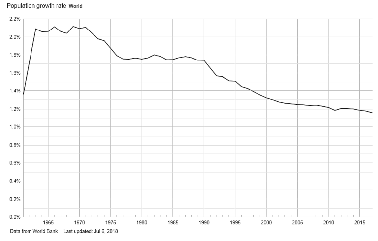
Figure A1 Population growth rate by year from 1960 to 2018, World Bank, 2018

Below is a plot of the world population growth rate that varies from about 2.1 to 1.1. This is used to make growth rate estimate of urban coverage. We note that natural aggregate used to build cities and roads are reasonably correlated to population growth in Figure A2a. Also of interest (Fig. A2b) is the fact that one can see some correlation to global warming with the use of natural aggregates.