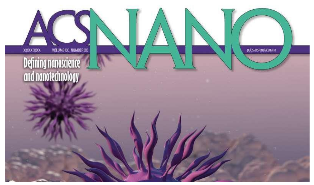
OSU researchers Olena and Oleh Taratula's work with magnetic nanoclusters as cancer therapy was featured on the cover of ACS\ Nano .

Olena Taratula and Oleh Taratula of the OSU College of Pharmacy tackled the problem by developing nanoclusters, multiatom collections of nanoparticles, with enhanced heating efficiency. The nanoclusters are hexagon-shaped <u>iron oxide nanoparticles</u> doped with cobalt and manganese and loaded into biodegradable nanocarriers.