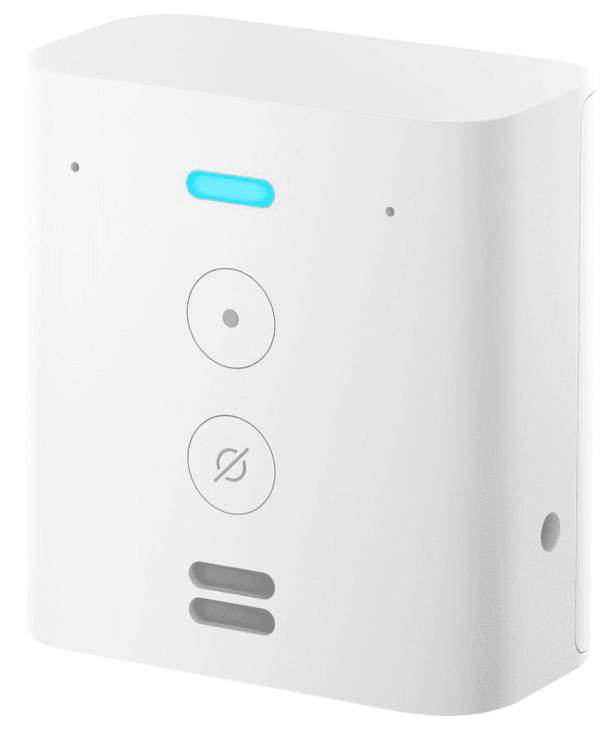
Fig 1: The Echo Flex from Amazon, an e-literacy solution and a new era in alternative computing models?(im-tomu n.d.; Krol 2019)