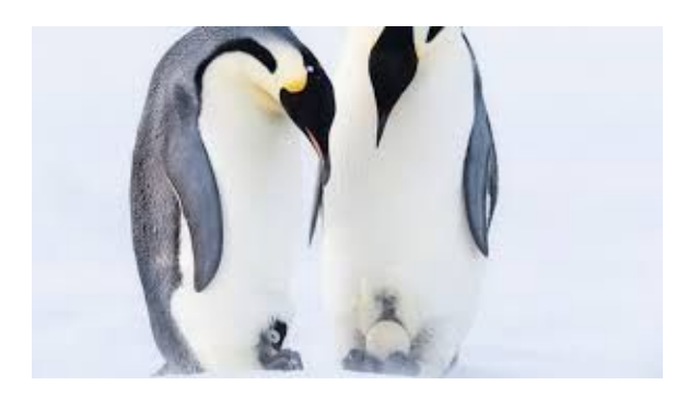
Fig 5: Hail Emperor!

Gecko: Yeti has all the feet you need, and if that is not enough, there is the linux penguin, happy feet! The emperor even has his kid-egg between the feet? Revenge of the Empire? Hail Emperor!