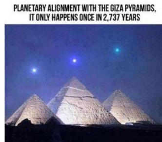
Picture 1: by Geroges Francis Tawdrous, Solar Group Geometric Structure [2]

In case of the Pyramids of Giza it could be a „time“ derived from cosmological observation. Tawdrows [1] explains that the Pyramids could be symbol for a Moon Metonic Cycle that repeats 2737 years Mercury, Venus and Saturn.