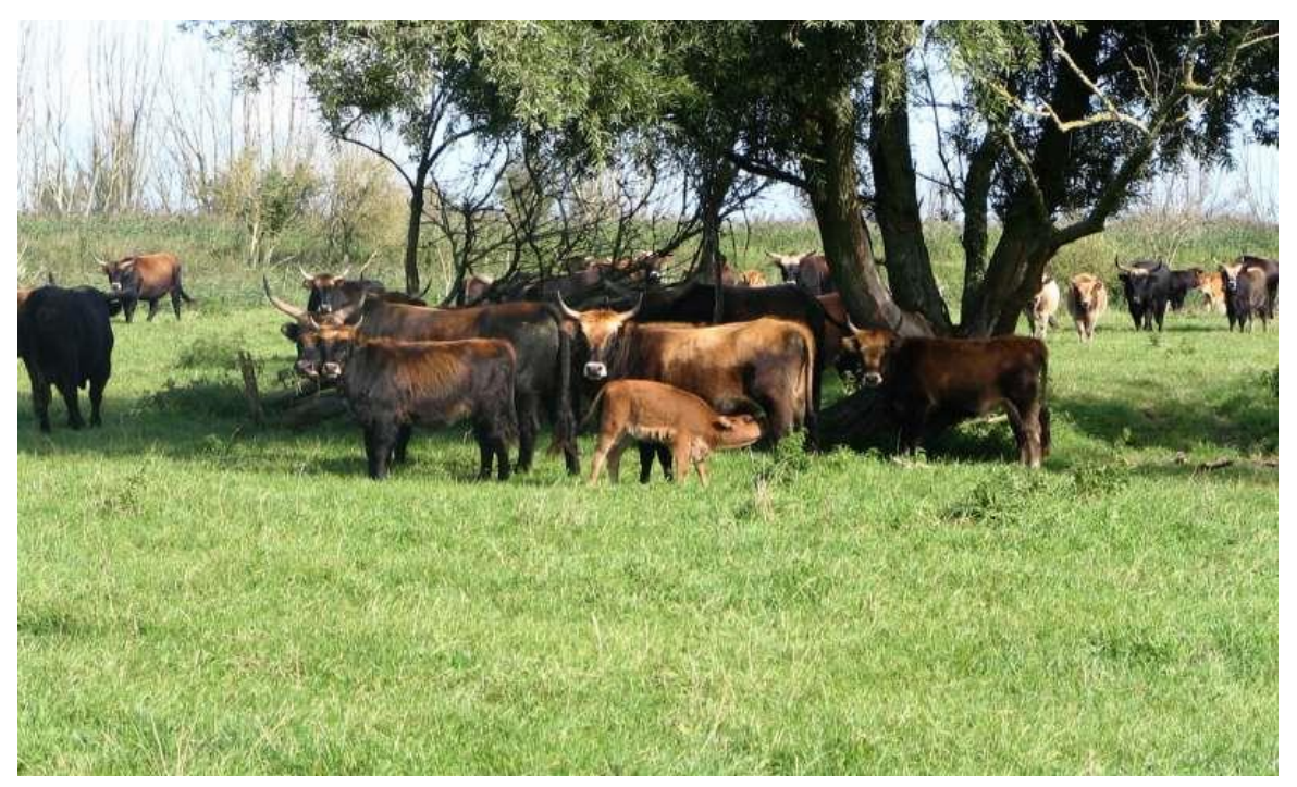
The Oostvadersplassen is a nature reserve close to Amsterdam in the Netherlands. Covering 56 sq km, this polder was created in 1968 as a haven for birds, but large herbivores were later introduced to reduced shrub cover.

Nuno Cesar De Sa from Leiden University explains, "I am interested in developing <u>remote-</u> <u>Sensing</u> methods to capture the 'plasticity' of vegetation species—so traits such as plant height and leaf size—with respect to herbivore pressure.