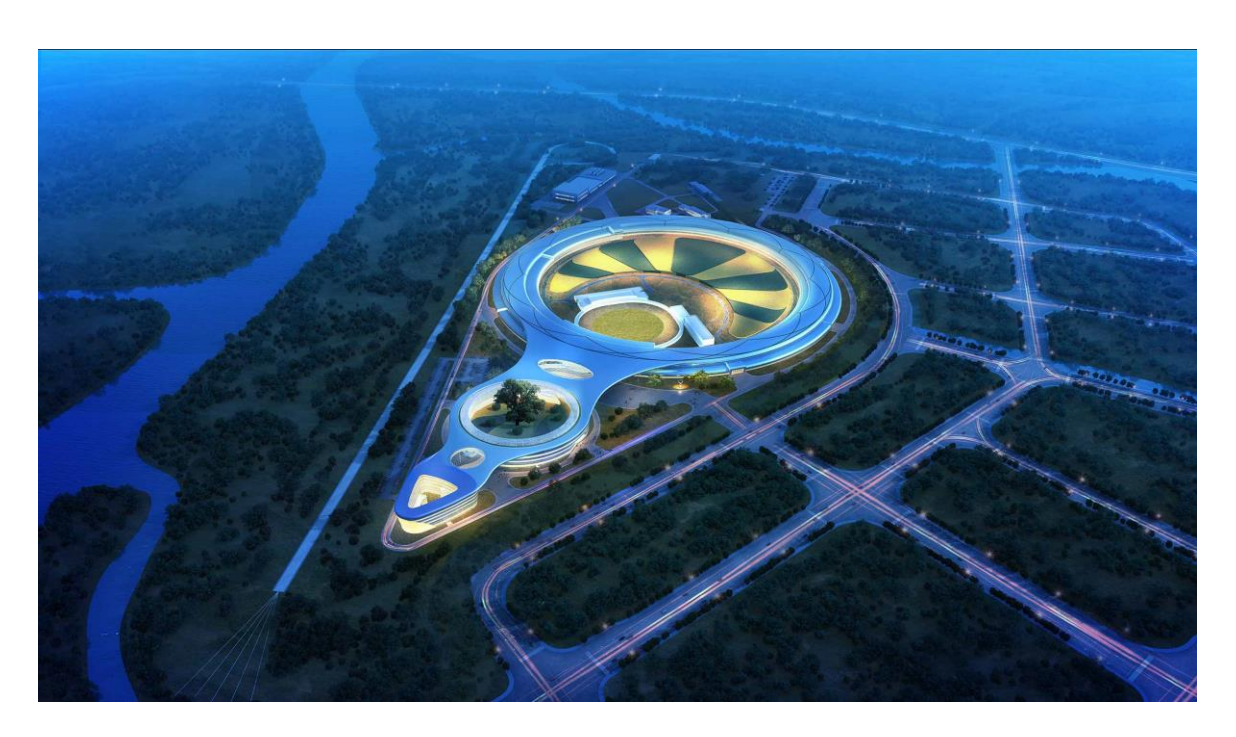
China's next big thing: a new fourth-generation synchrotron facility in Beijing

Current stabilization techniques use a combination of predetermined models and tedious manual calibrations to achieve a stability of around 10% of the electron beam width. This is adequate for third-generation facilities, but much tighter control will be needed in fourth-generation synchrotrons.