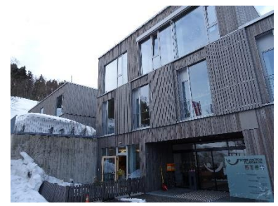
Fig. 6. Entrance to Social Center Pillerseetal with kindergarten to the left.

Moreover, there is a kindergarten (Figs. 1 and 6) uphill and frequent interaction between kindergarten kids and nursery home residents.