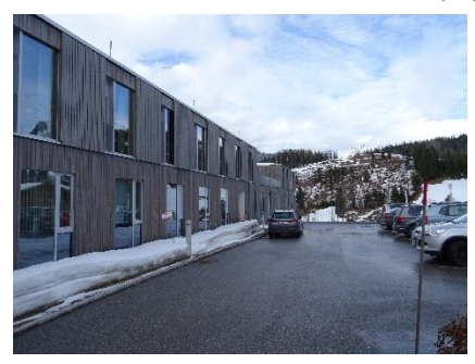
Fig. 8. Part of Social Center Pillerseetal with two floors of stacked CLT module rooms.

Mr. Herbert Breitmayer, the care service director (Pflegedienstleiter) received me in the café, offered me delicious cake, coffee and a canned bio lemonade, quite refreshing. He first had to finish off a seminar course. He handed me the photo book of the construction to see. I found the building has relatively high ceilings (Fig. 13). On the outside it looks plain grey. Vertical boards and high windows appear alternately. The wood module structure is not discernible from the outside (Figs. 6+8).