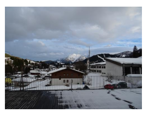
Fig. 5. Panorama balcony.

Also spacious outdoor balconies (Fig. 6) provide splendid views to breathtaking alpine scenery.