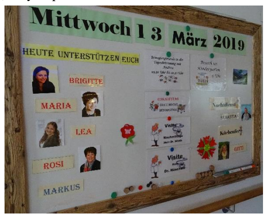
Fig. 12. Notice board showing current care givers, etc.

Family and visitors are so impressed, that later they often become volunteers. Professionals and volunteers together (Fig. 12) constitute now about 100 staff, including a beauty shop and hair dresser, something very, very important for the clients.