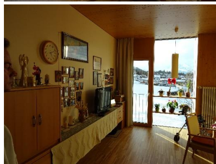
Fig. 13. Spacious, light filled, high ceiling, full height panorama windows (top). Left side wall white for personal decoration (bottom).

At the same time the rooms are grouped around the dining space, which makes meeting easy. Mr. Breitmayer said, in his old facility, they had three beds in one room, and a low 195cm ceiling. One room now has 27 square meters.