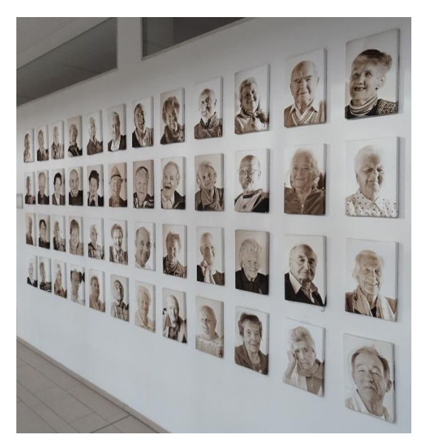
Fig. 9. Photo installation with 48 faces of residents.

but had more in the past, which did not survive the heavy snow loads (seven months per year). Maybe with heat pumps high temperatures in the water heating (for space heating) facilities, could be further exploited for energy efficiency. Wood chip boilers or wood gas cogenerators are currently not used, due to costs and the question if the wood chips would always be ecologically locally sourced and supplied or if cheaper wood chips from eastern European countries would be purchased instead.