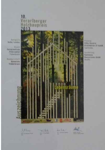
Fig. 2. Certificate of 10<sup>th</sup> Vorarlberger Wood Building Prize.

pp. 23+24), a Japanese magazine about the Social Center Pillerseetal in Fieberbrunn project of 2011. He also showed me some poster on the wall from which I learned, that it was a Europa wide architecture competition among 120 companies, and SK won the bid.