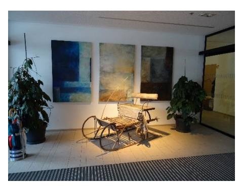
Fig. 11. Chapel (top), seminar room with mannequin (center), interior decoration (bottom).

Family and visitors are so impressed, that later they often become volunteers. Professionals and volunteers together (Fig. 12) constitute now about 100 staff, including a beauty shop and hair dresser, something very, very important for the clients.