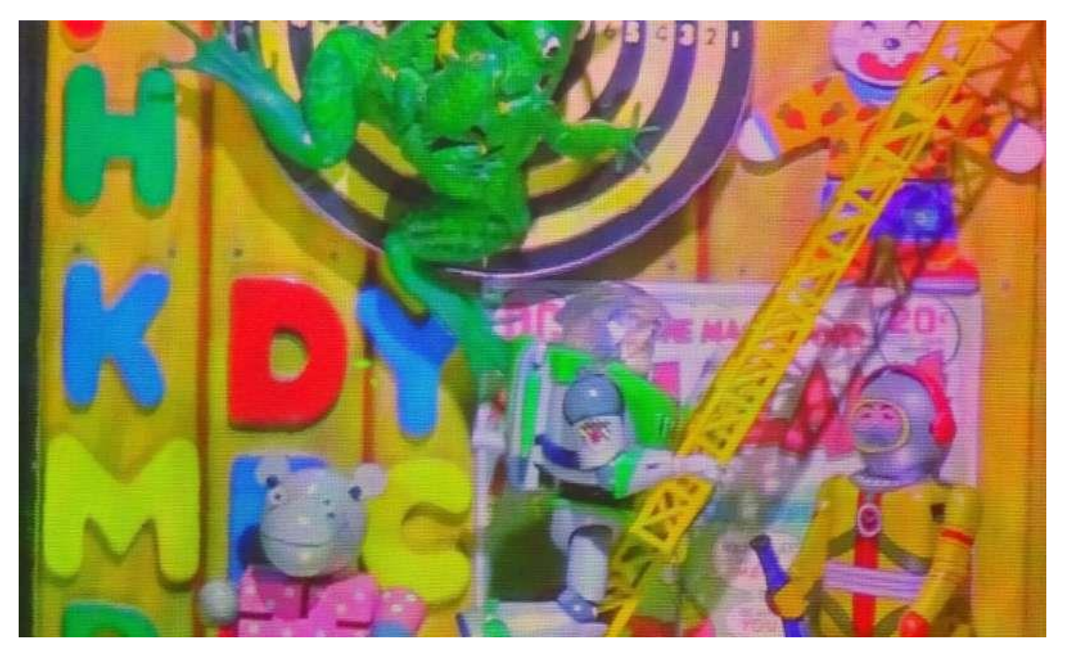
Researchers developed a new system that prints holograms such as the one shown with an unprecedented level of detail and realistic color.

"The companies involved in developing the first two generations of printers eventually faced technical limitations and closed," said Gentet. "Our small, self-funded group found that it was key to develop a highly sensitive photomaterial with a very fine grain rather than use a commercially available rigid material like previous systems."