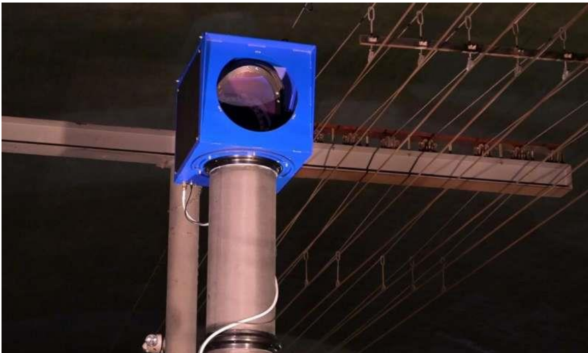
A two-kilowatt laser transmitter atop a 13-foot-high tower, part of the long-range, free-space power beaming system.

"If we could capture the boundless sunlight in space, where it's brighter than anywhere on Earth, [we could] send it to places that are difficult and expensive to get energy to today," he said. "If we can do that in an effective way and do for energy what GPS has done for navigation, it would truly be revolutionary."